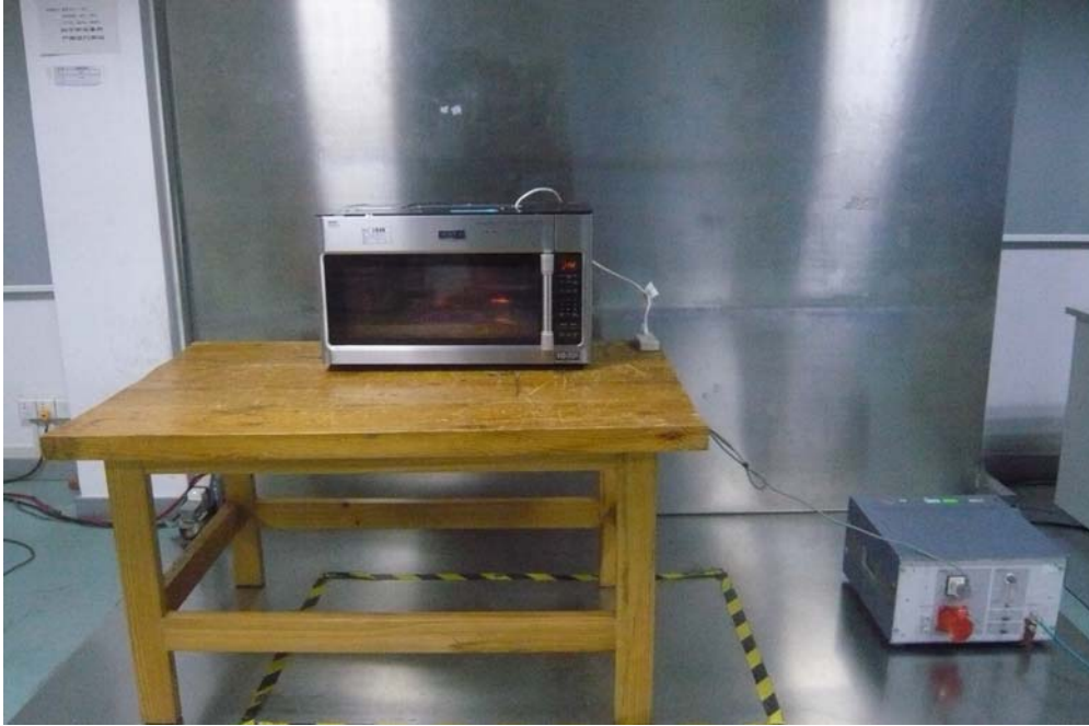
Conducted Emissions - Side View