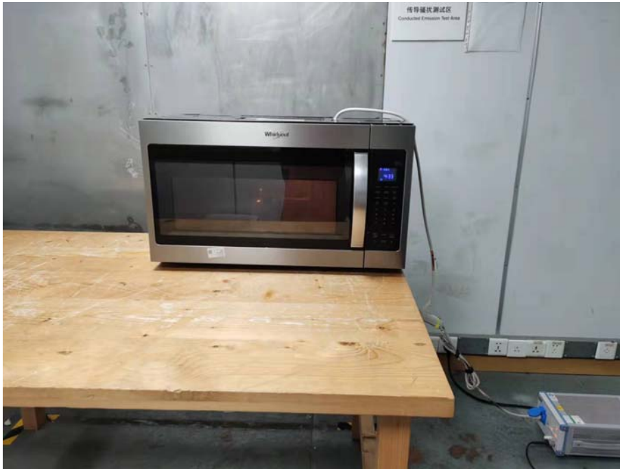
Photo of Power Line Conducted Emission Measurement