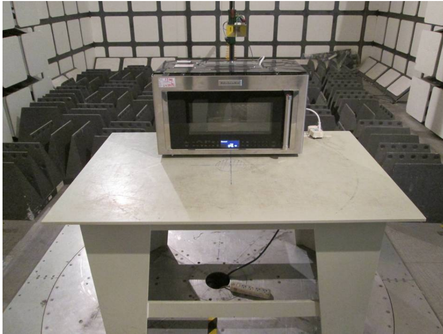
Radiated Emissions - Rear View (Above 1 GHz)