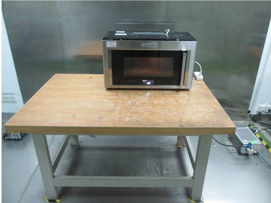
Conducted Emissions - Side View