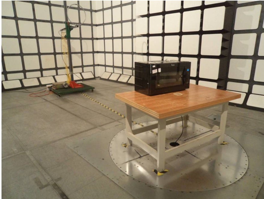
Radiated Emissions - Rear View (9 kHz – 30 MHz)