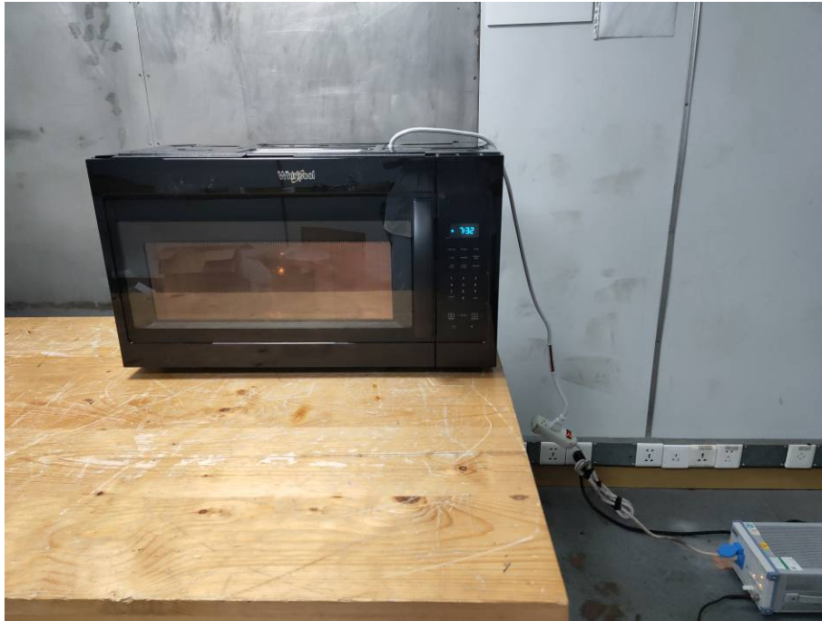
Photo of Power Line Conducted Emission Measurement