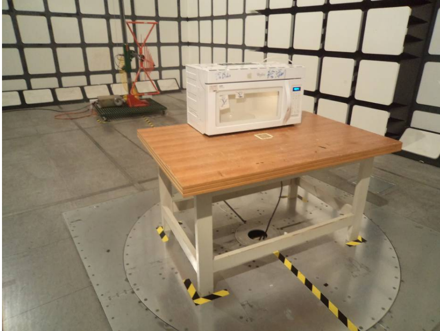
Radiated Emissions - Rear View (30 MHz – 1 GHz)