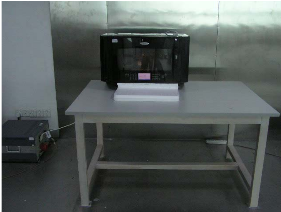
Conducted Emission–Side View