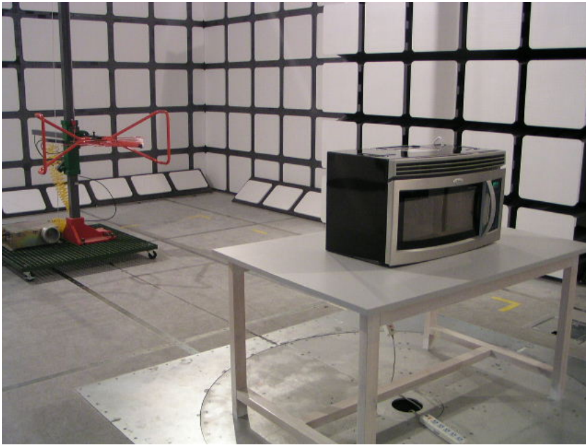
30 MHz to 1000 MHz- Radiated Emission–Rear View