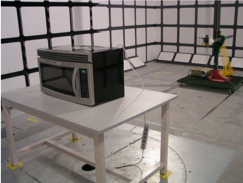
Above 1 GHz -Radiated Emission–Rear View