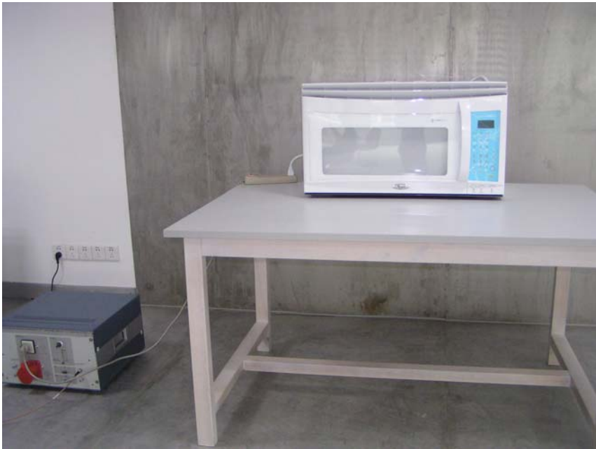
Conducted Emission–Side View