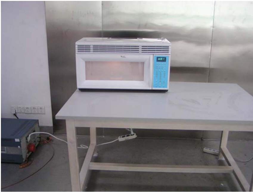
Conducted Emission–Side View