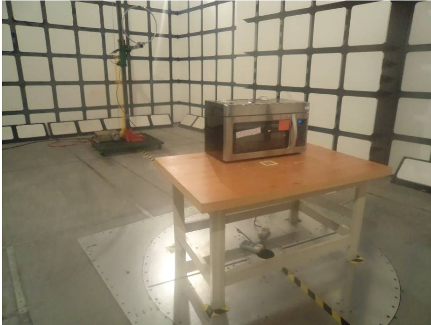
Radiated Emissions - Rear View (9 kHz – 30 MHz)