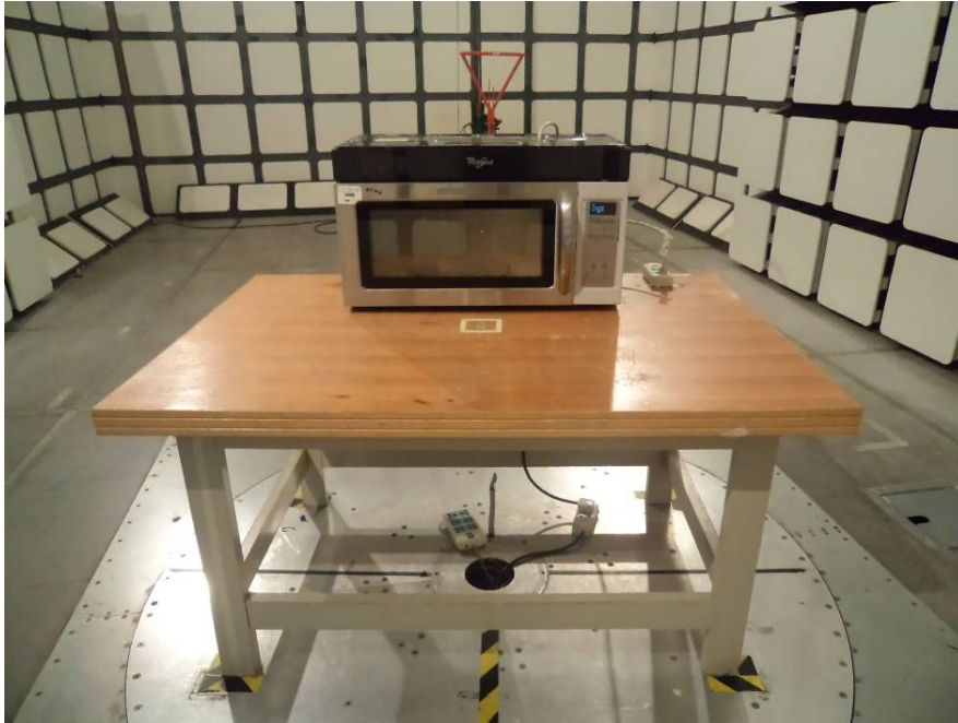
Radiated Emissions - Rear View (30 MHz – 1 GHz)