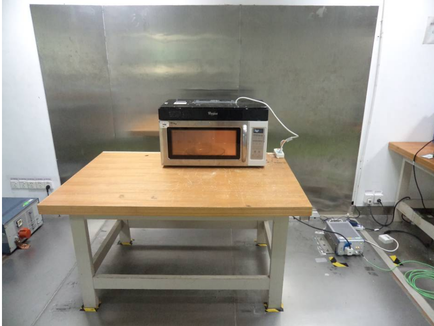
Conduction Emissions - Side View