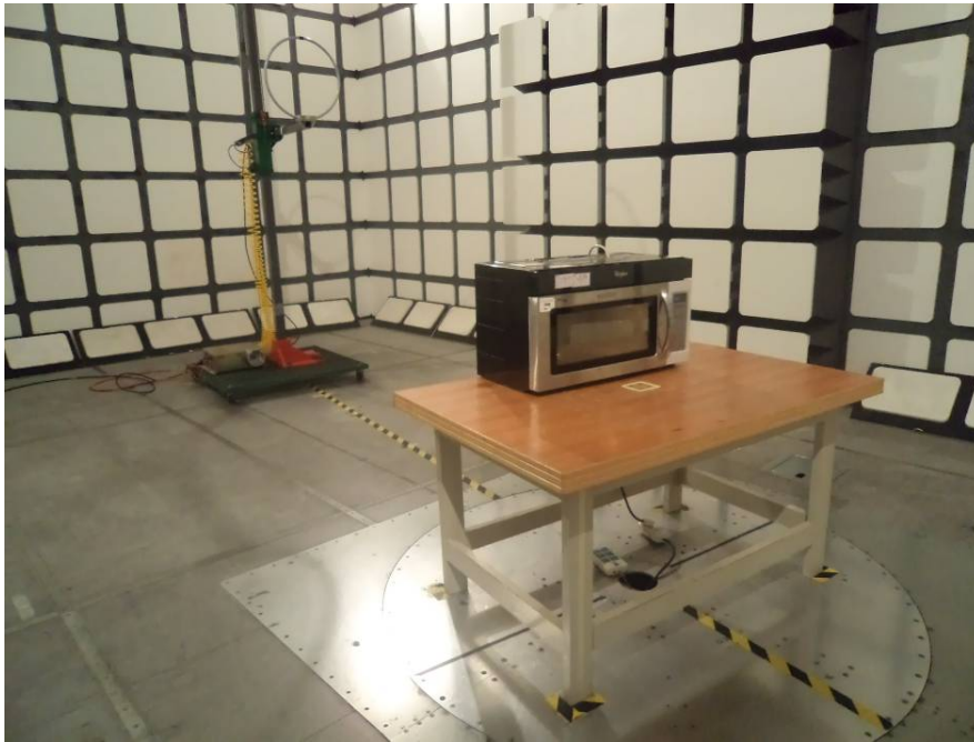
Radiated Emissions - Rear View (9 kHz – 30 MHz)