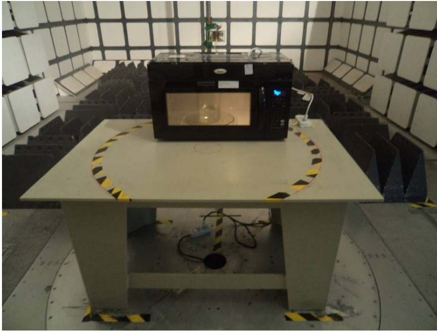
Radiated Emissions (1 GHz to 25 GHz) – Rear View