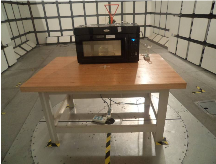
Radiated Emissions (30 MHz to 1GHz) - Rear View