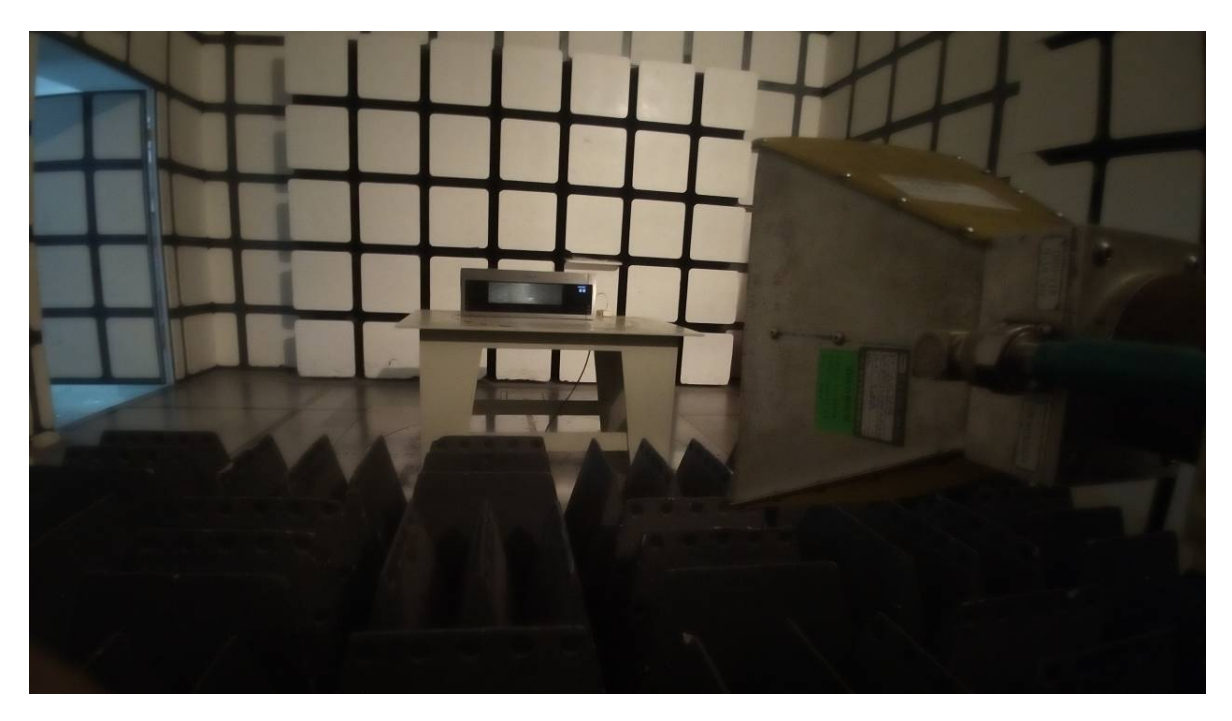
Radiated Emissions - Front View (Above 1 GHz)