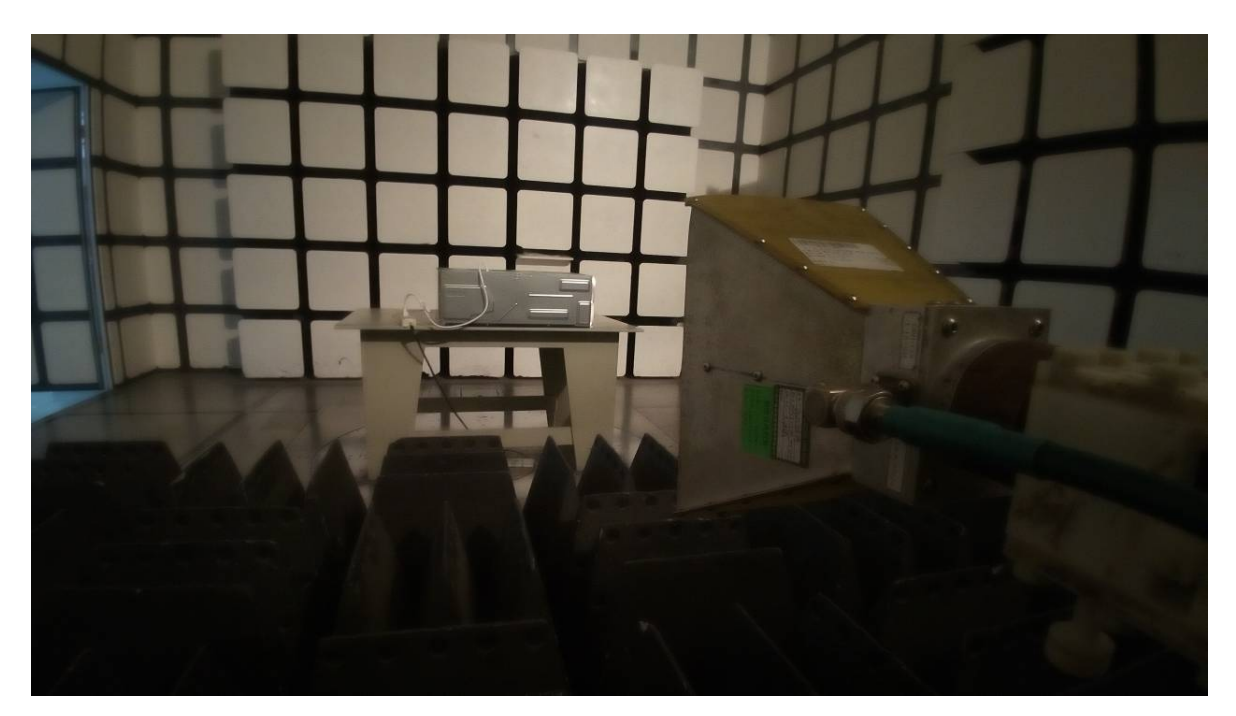
Radiated Emissions - Rear View (Above 1 GHz)