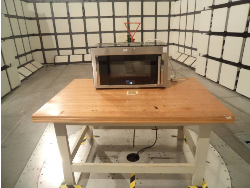
Radiated Emissions - Rear View (30 MHz – 1 GHz)