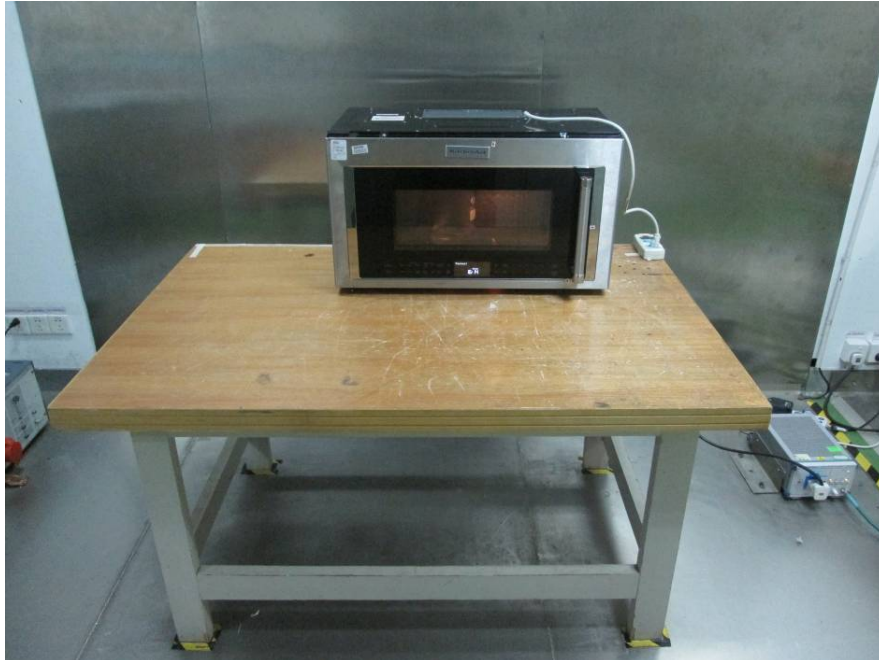
Conducted Emissions - Side View