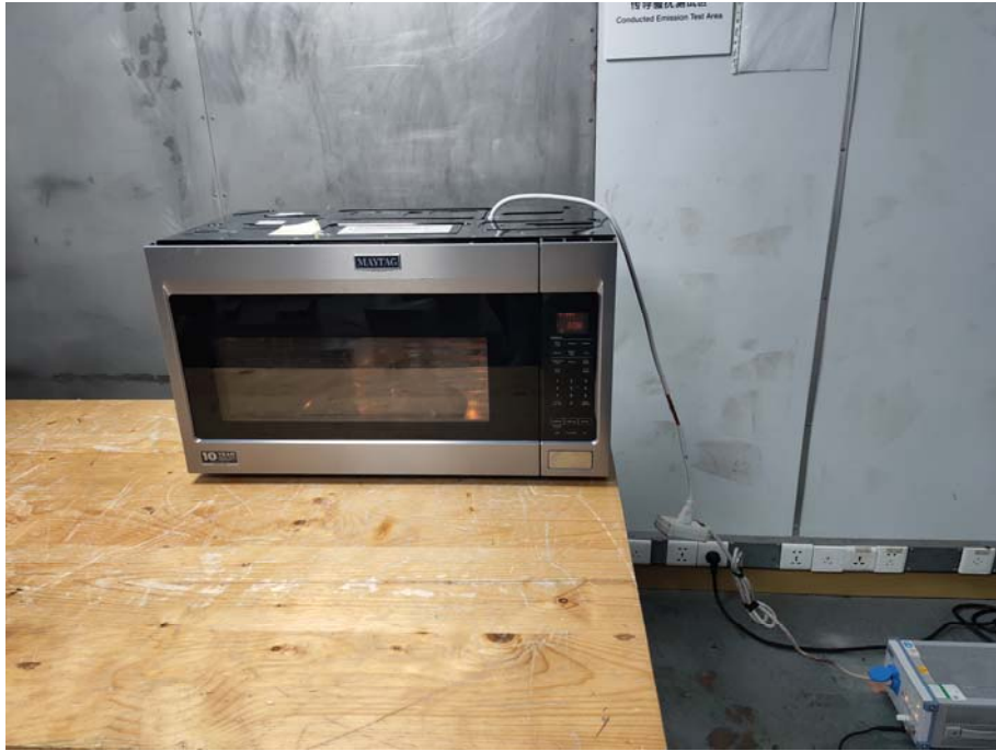
Photo of Power Line Conducted Emission Measurement