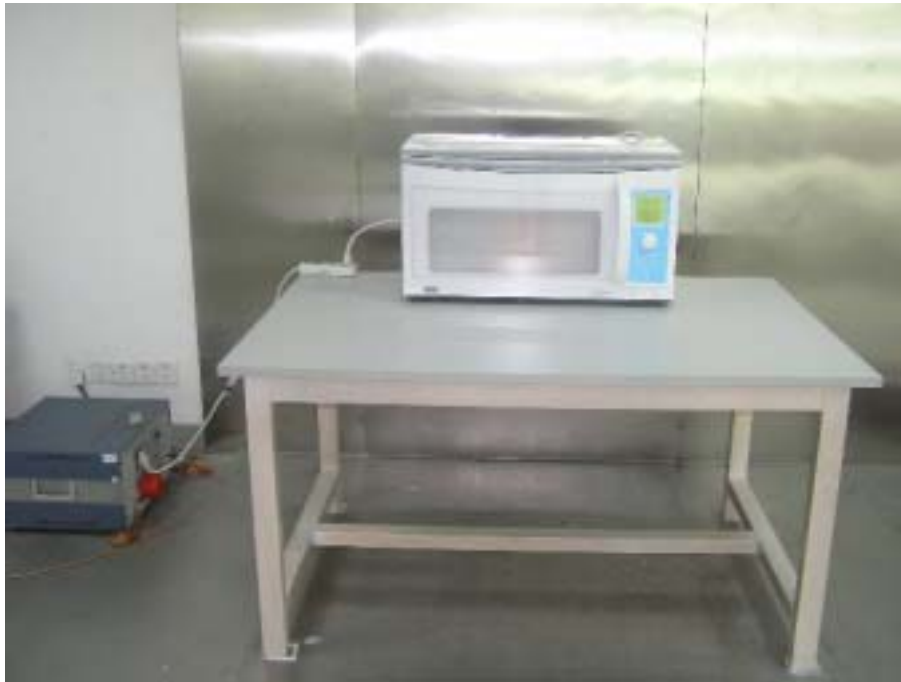
Conducted Emission–Side View