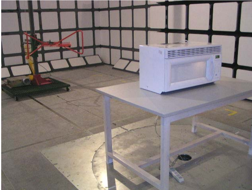
30 MHz to 1000 MHz- Radiated Emission–Rear View