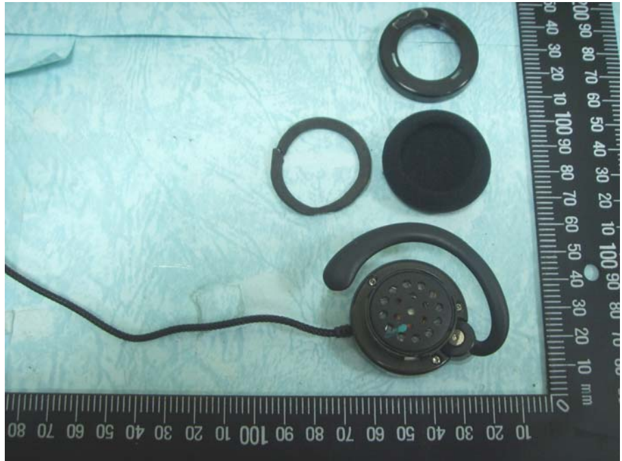
BTST-8010, BTST-8110 (with microphone) (page A9~A16)