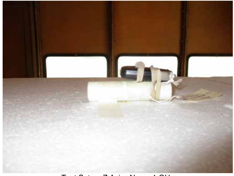
Test Setup, Z Axis, Above 1 GHz