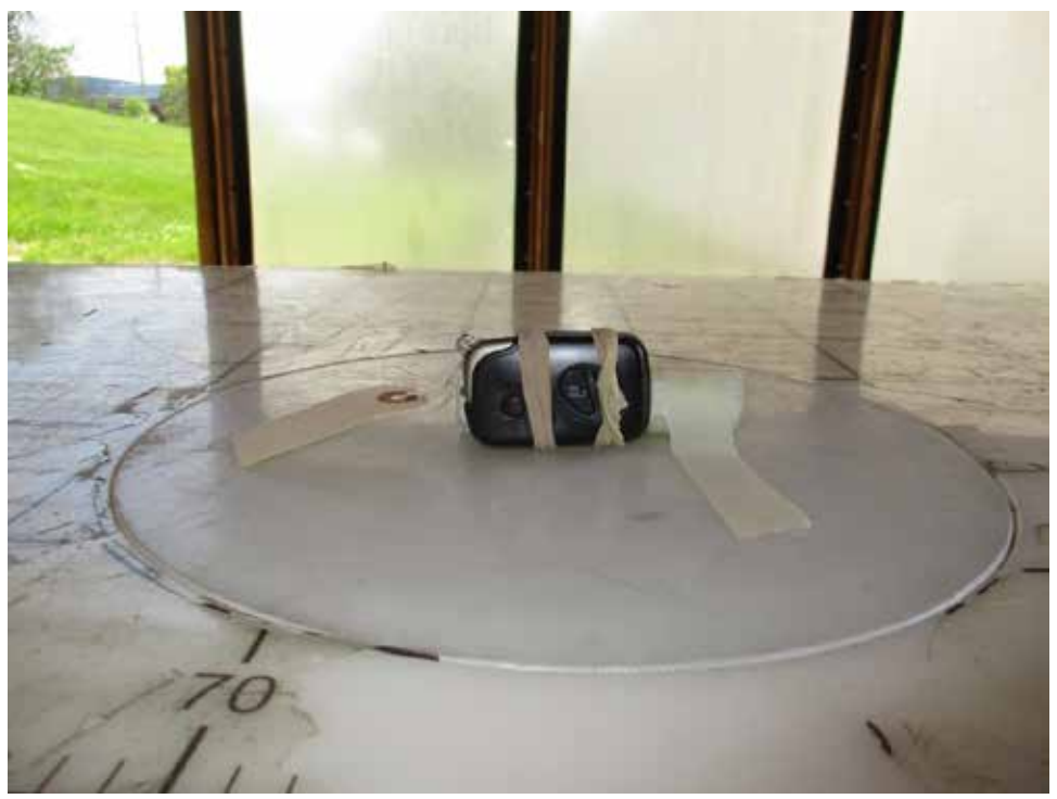
Test Setup, Y Axis, Below 1 GHz