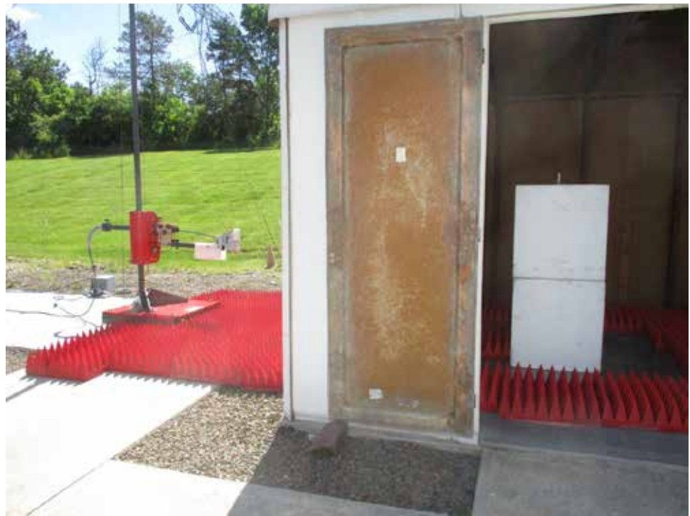
Horizontal Antenna Polarization, Above 1 GHz