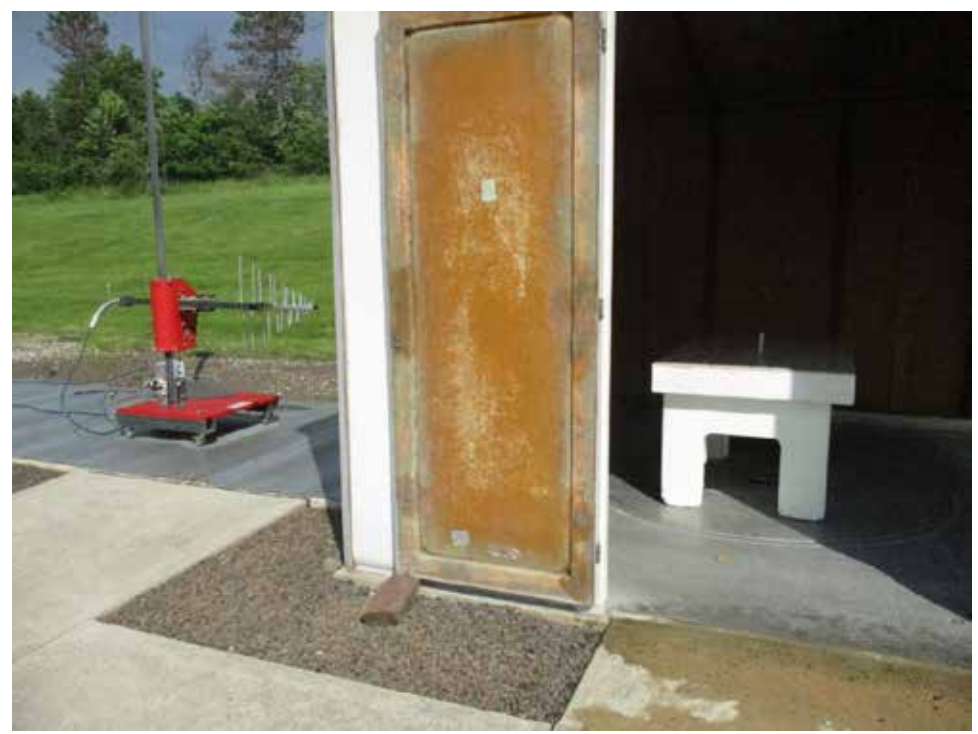
Vertical Antenna Polarization, Below 1 GHz