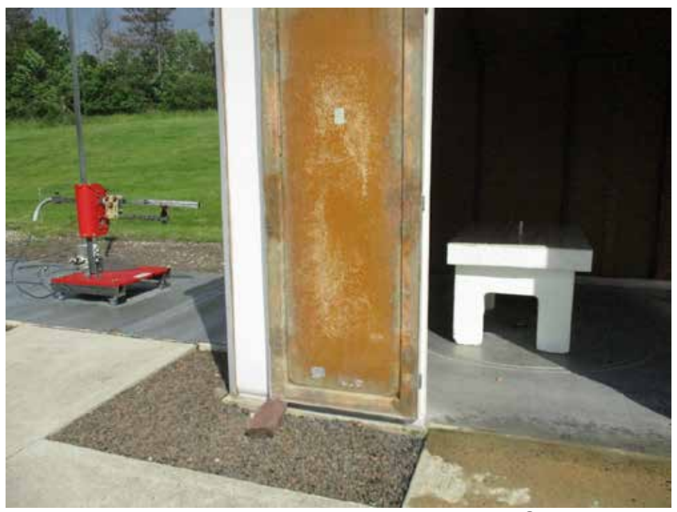
Horizontal Antenna Polarization, Below 1 GHz