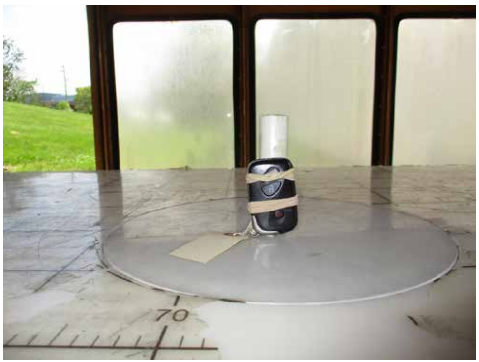
Test Setup, X Axis, Below 1 GHz