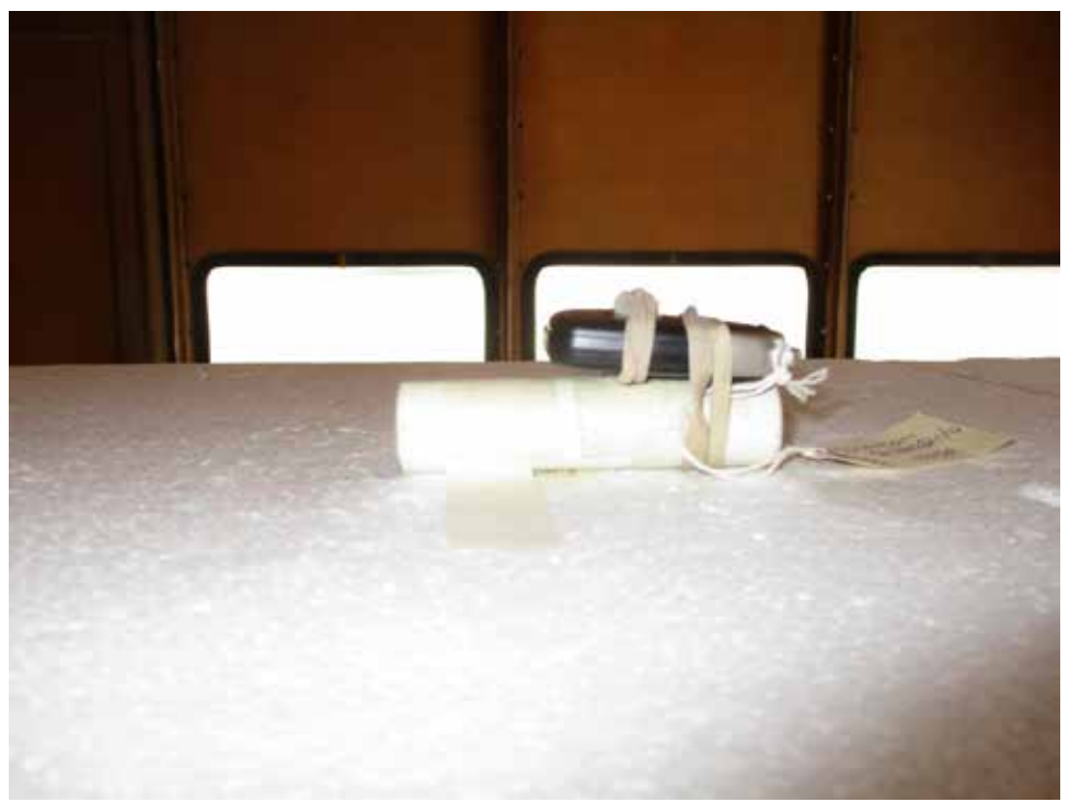
Test Setup, Z Axis, Above 1 GHz