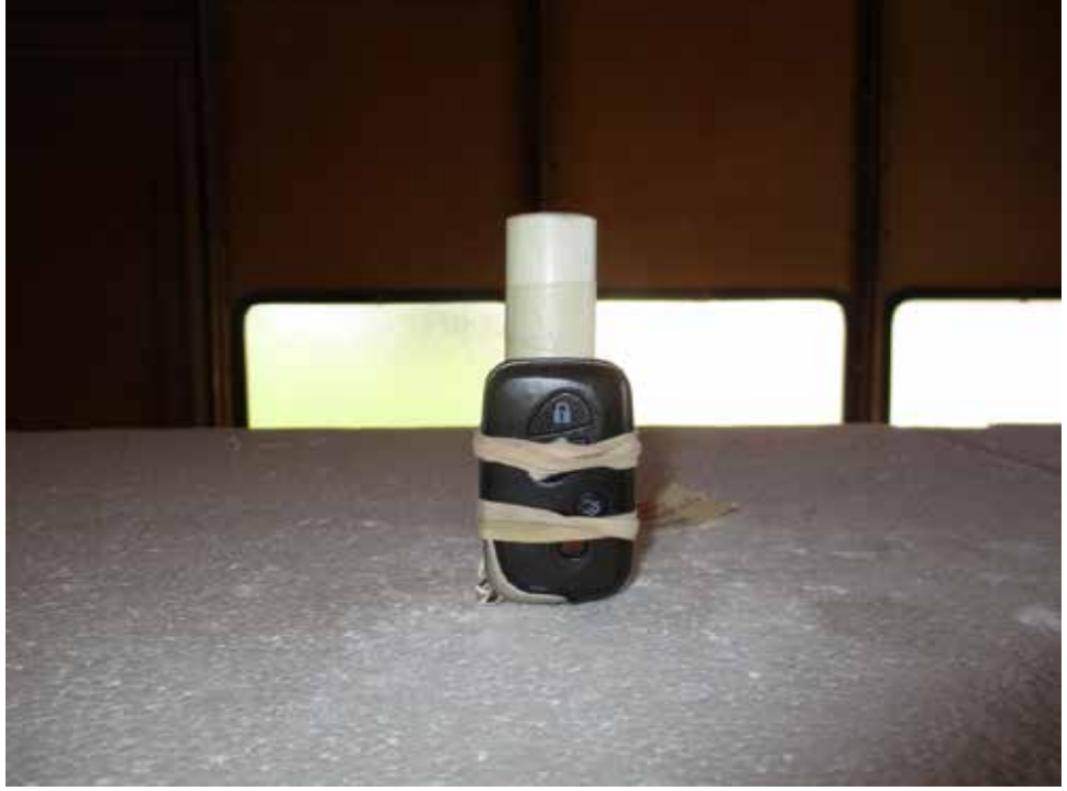
Test Setup, X Axis, Above 1 GHz