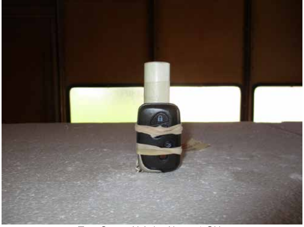
Test Setup, X Axis, Above 1 GHz