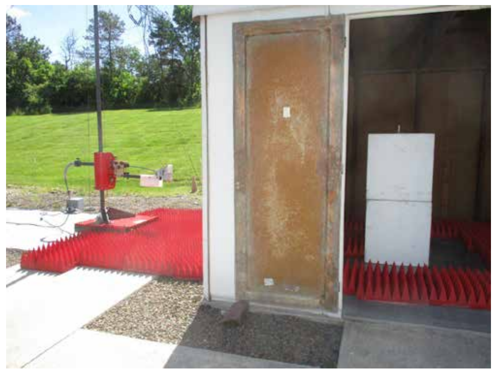
Horizontal Antenna Polarization, Above 1 GHz