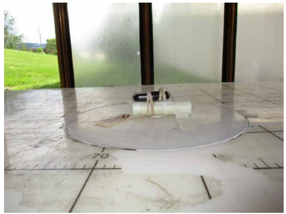
Test Setup, Z Axis, Below 1 GHz