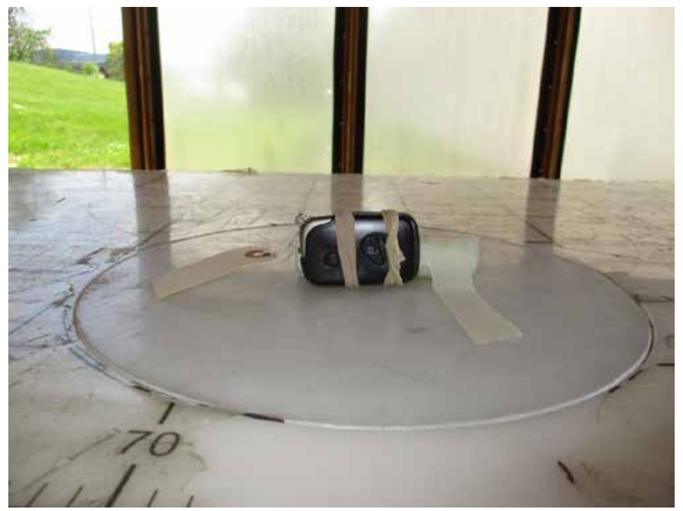
Test Setup, Y Axis, Below 1 GHz