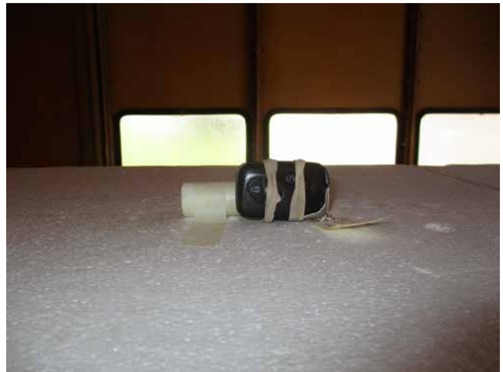
Test Setup, Y Axis, Above 1 GHz