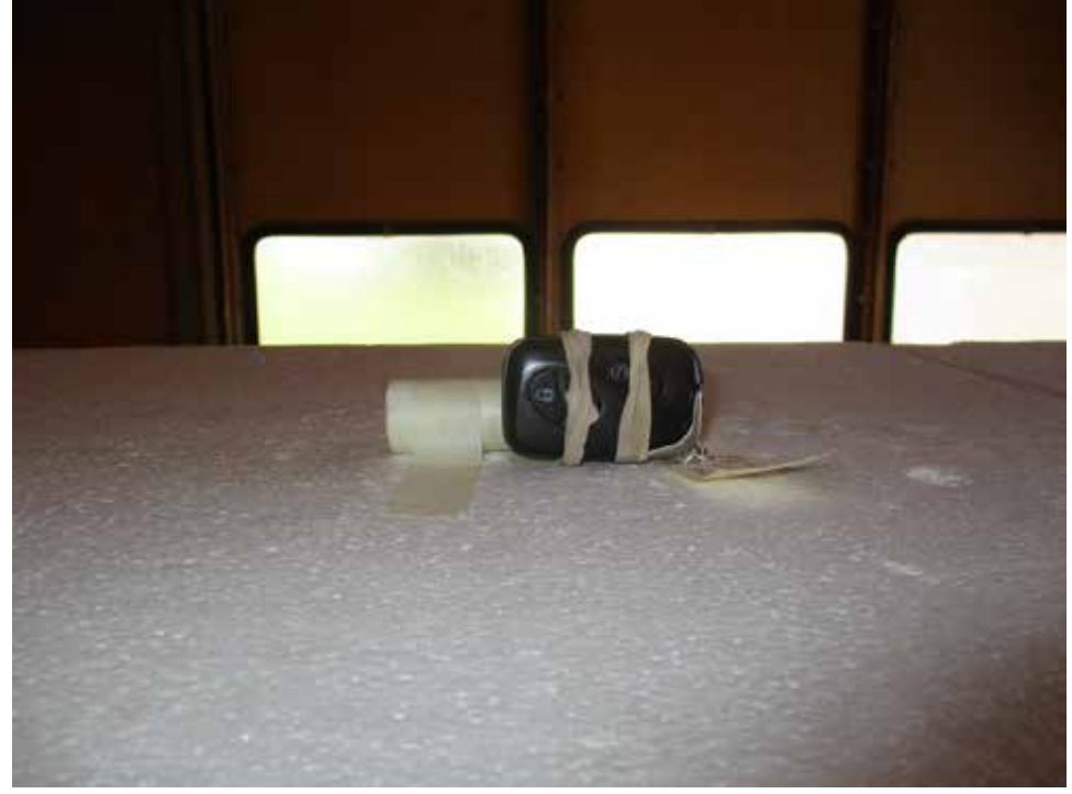
Test Setup, Y Axis, Above 1 GHz