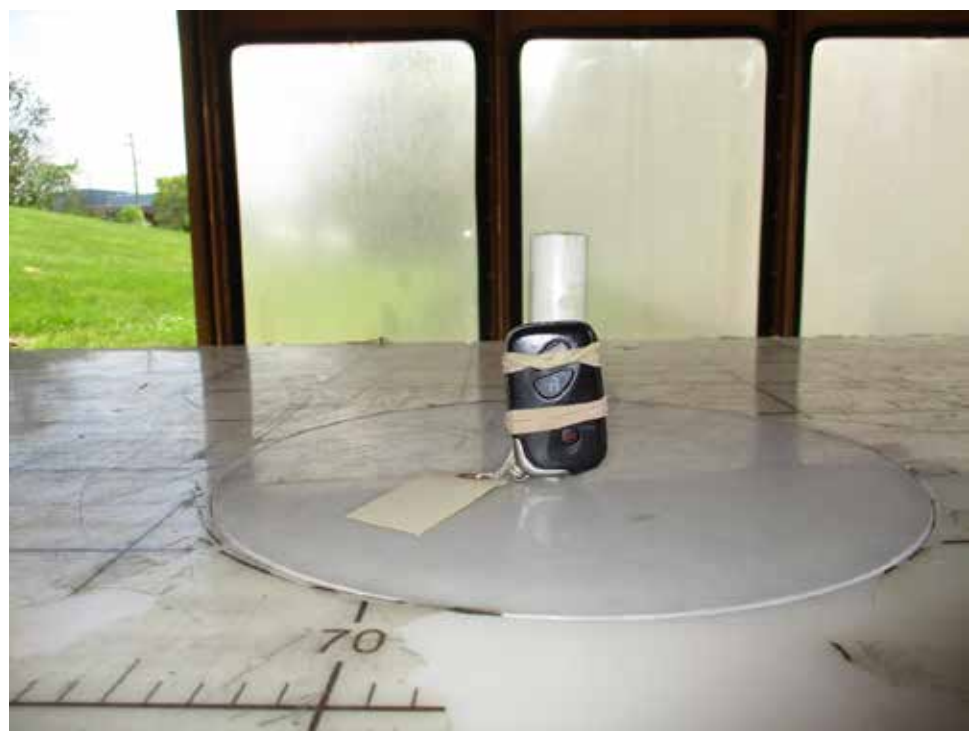
Test Setup, X Axis, Below 1 GHz