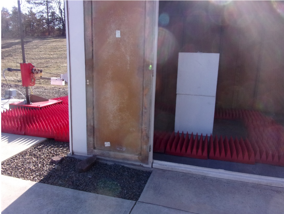
Horizontal Antenna Polarization, Above 1 GHz