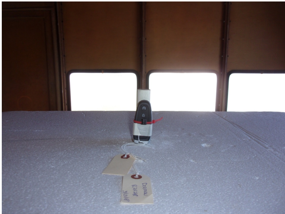
Test Setup, X Axis, Above 1 GHz