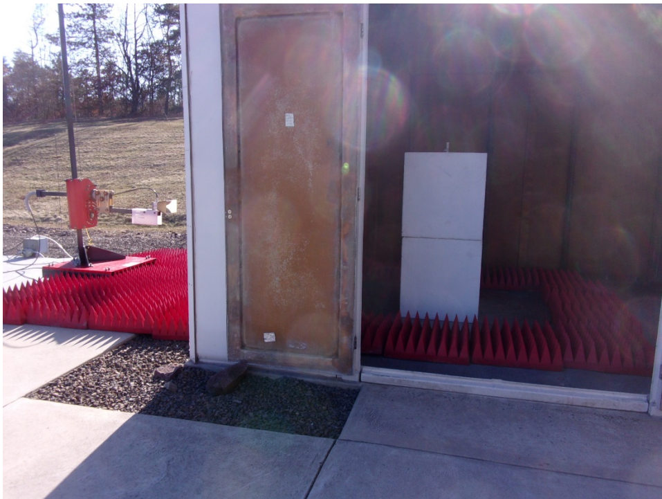
Vertical Antenna Polarization, Above 1 GHz