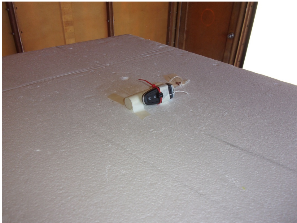
Test Setup, Z Axis, Above 1 GHz