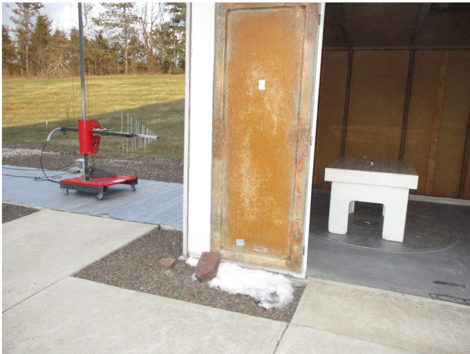
Vertical Antenna Polarization, Below 1 GHz