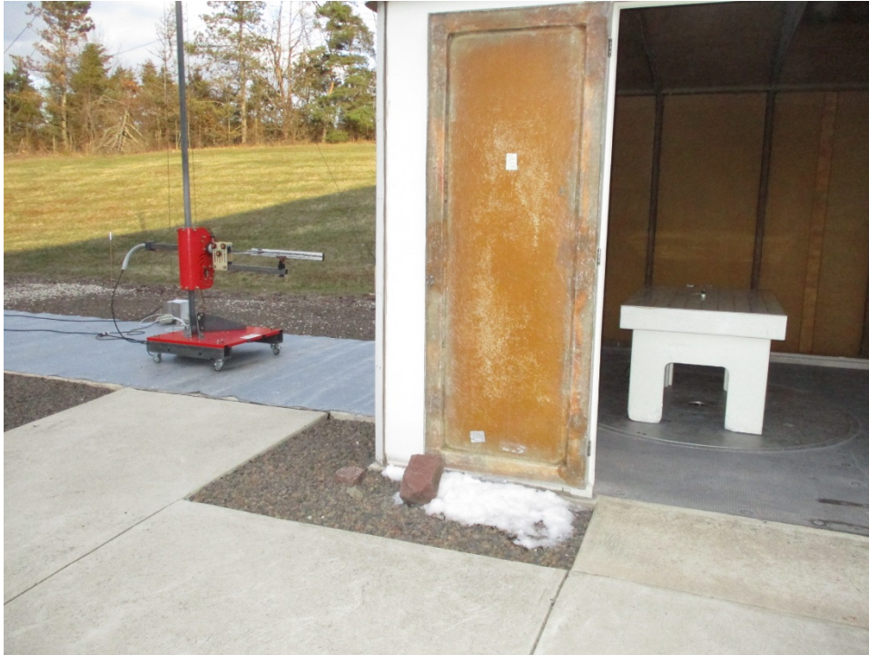
Horizontal Antenna Polarization, Below 1 GHz