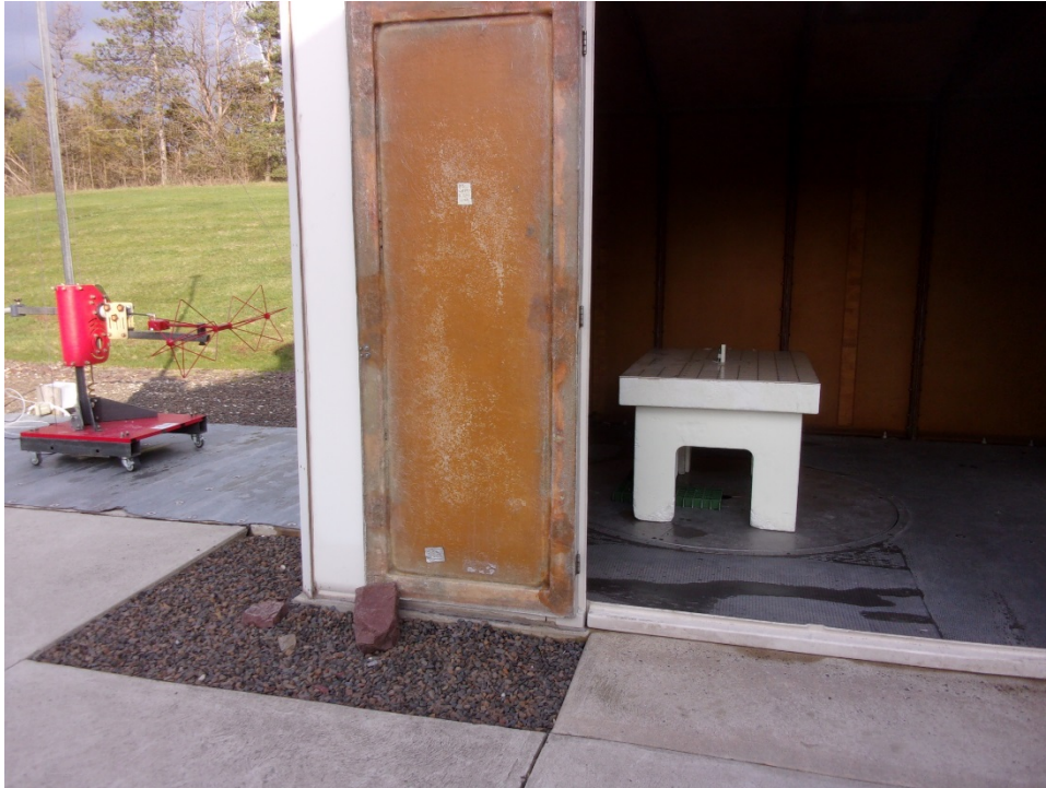
Test Setup, 30 to 200 MHz