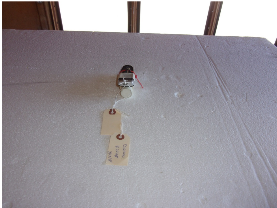
Test Setup, Y Axis, Above 1 GHz