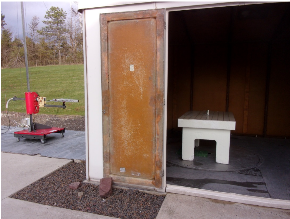
Test Setup, 200 MHz to 1 GHz