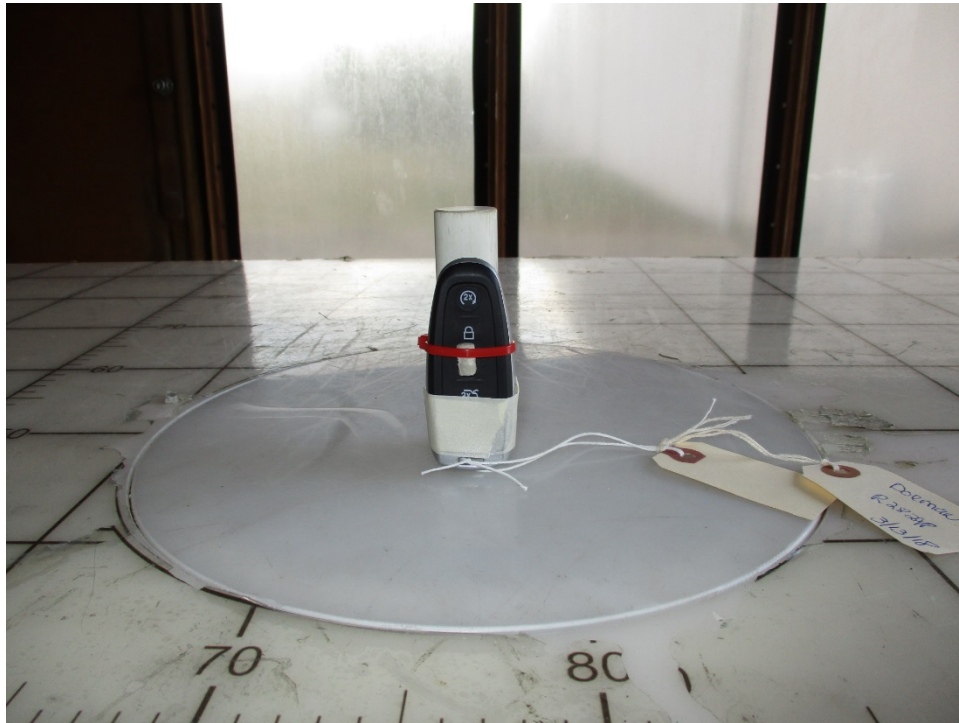
Test Setup, X Axis, Below 1 GHz