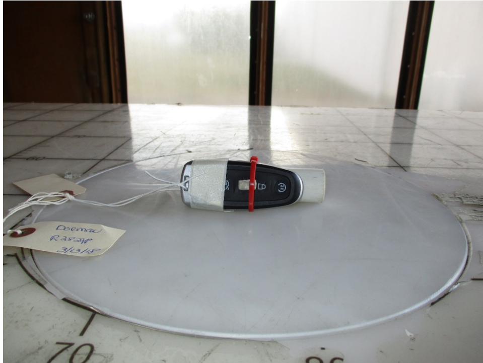
Test Setup, Z Axis, Below 1 GHz