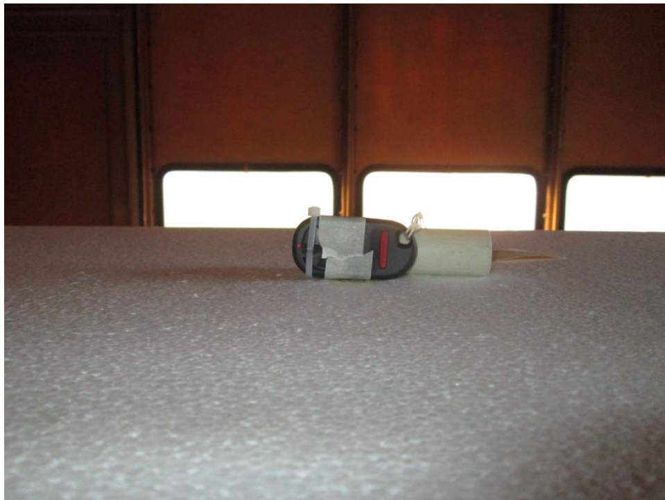
Test Setup, Y Axis, Above 1 GHz