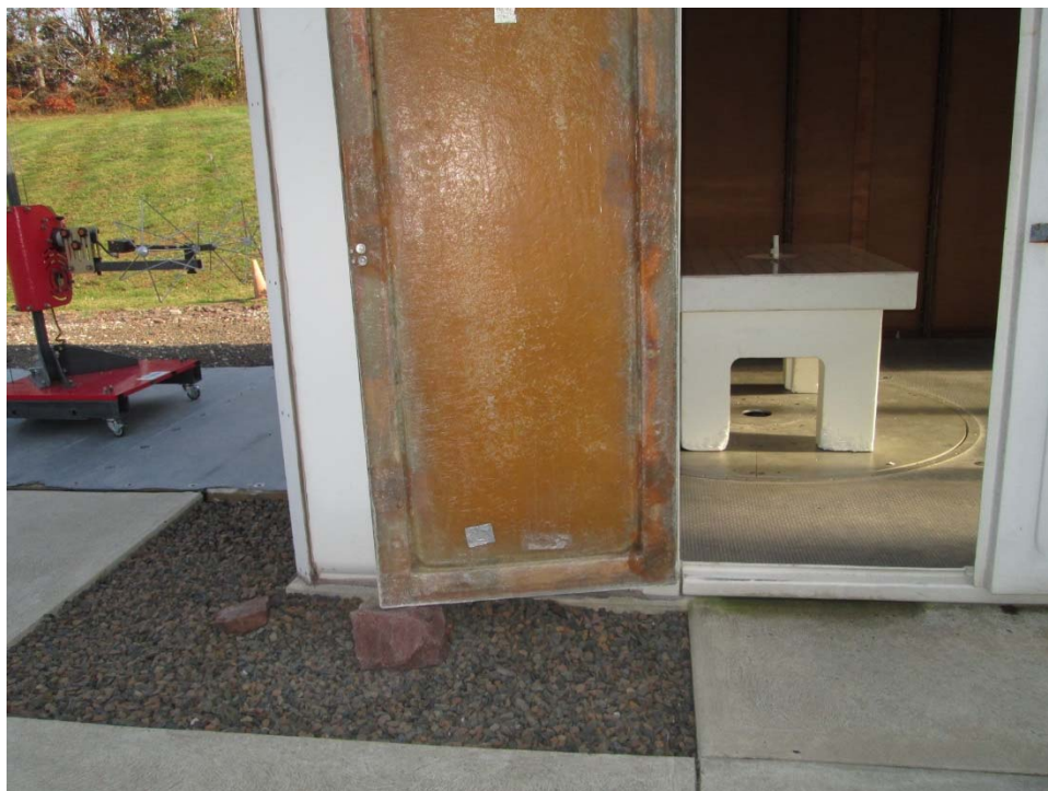
Horizontal Antenna Polarization, Below 1 GHz