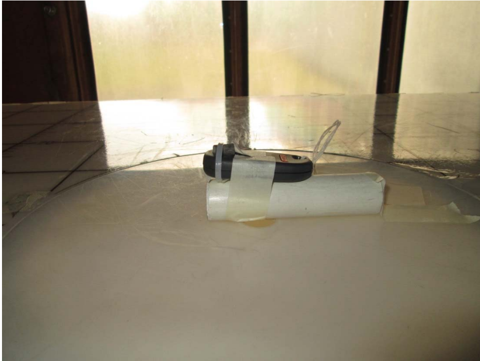
Test Setup, Z Axis