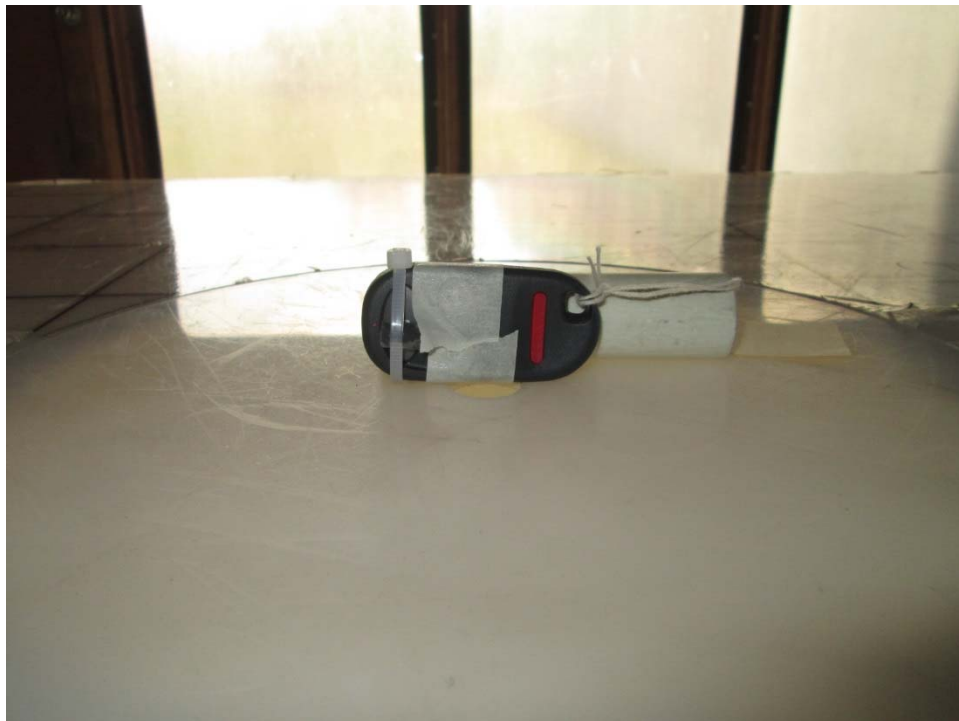
Test Setup, Y Axis