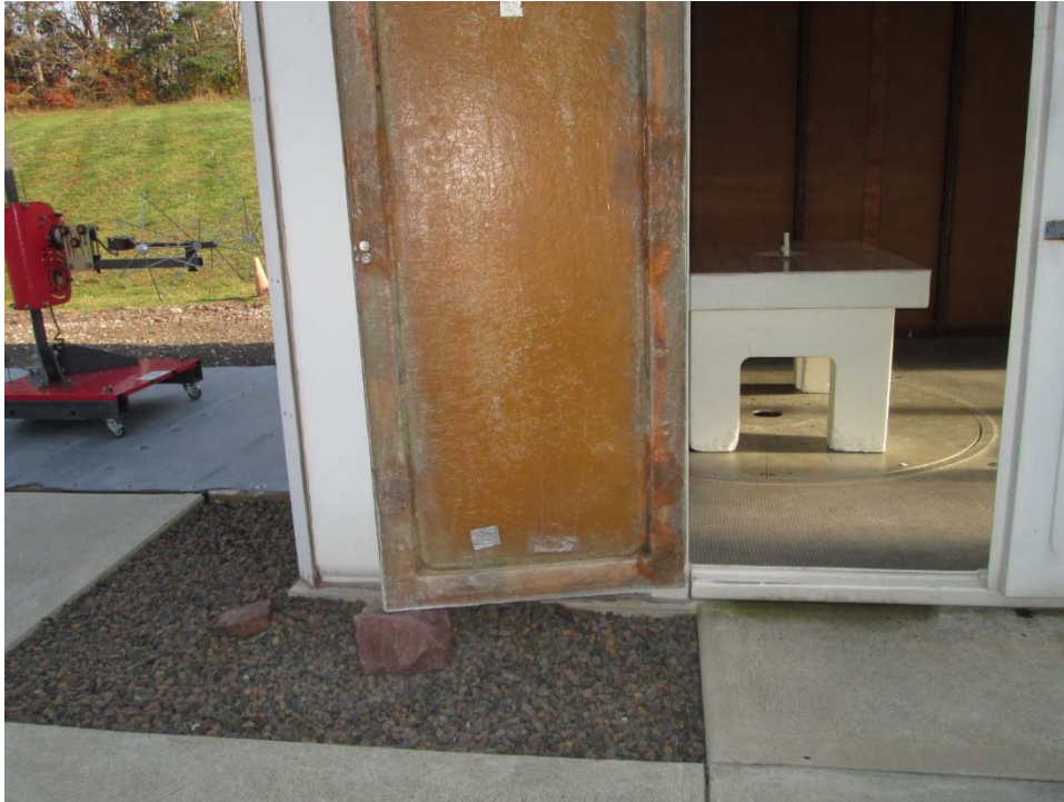
Horizontal Antenna Polarization, 30 to 200 MHz