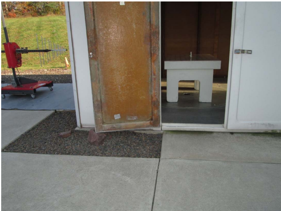
Vertical Antenna Polarization, 200 MHz to 1 GHz