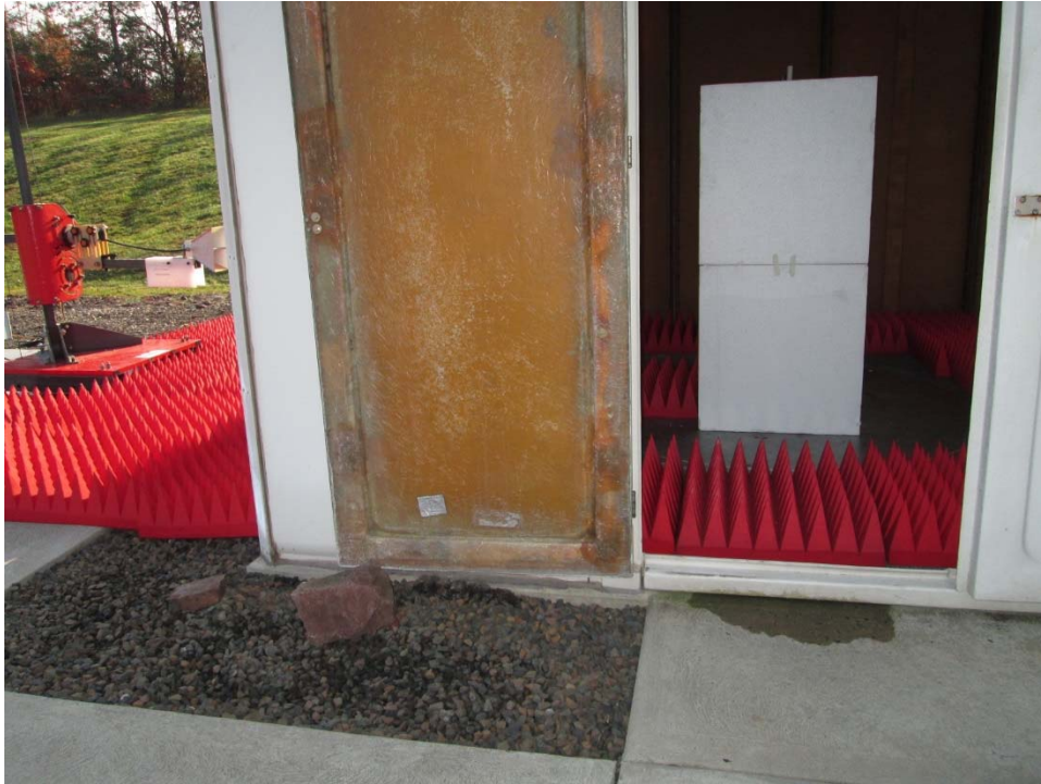
Horizontal Antenna Polarization, Above 1 GHz