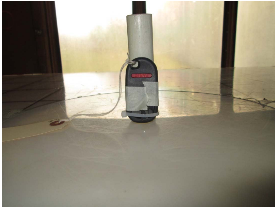
Test Setup, X Axis