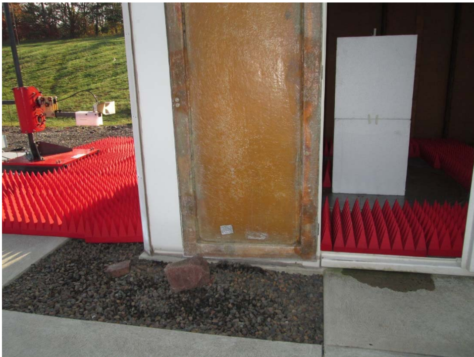
Vertical Antenna Polarization, Above 1 GHz