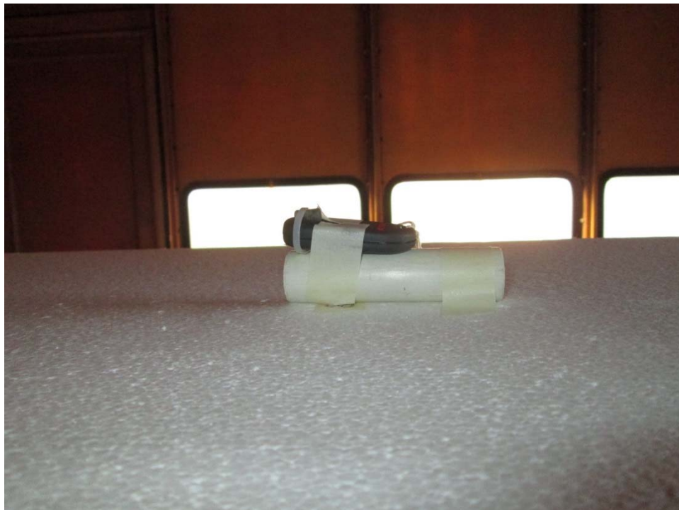
Test Setup, Z Axis, Above 1 GHz