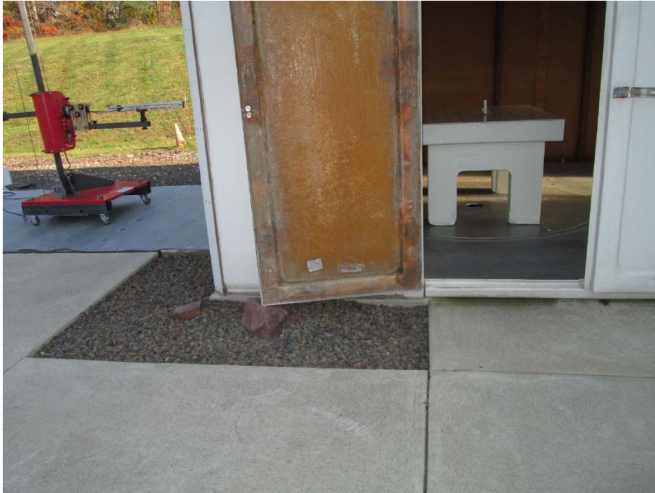
Horizontal Antenna Polarization, Above 1 GHz