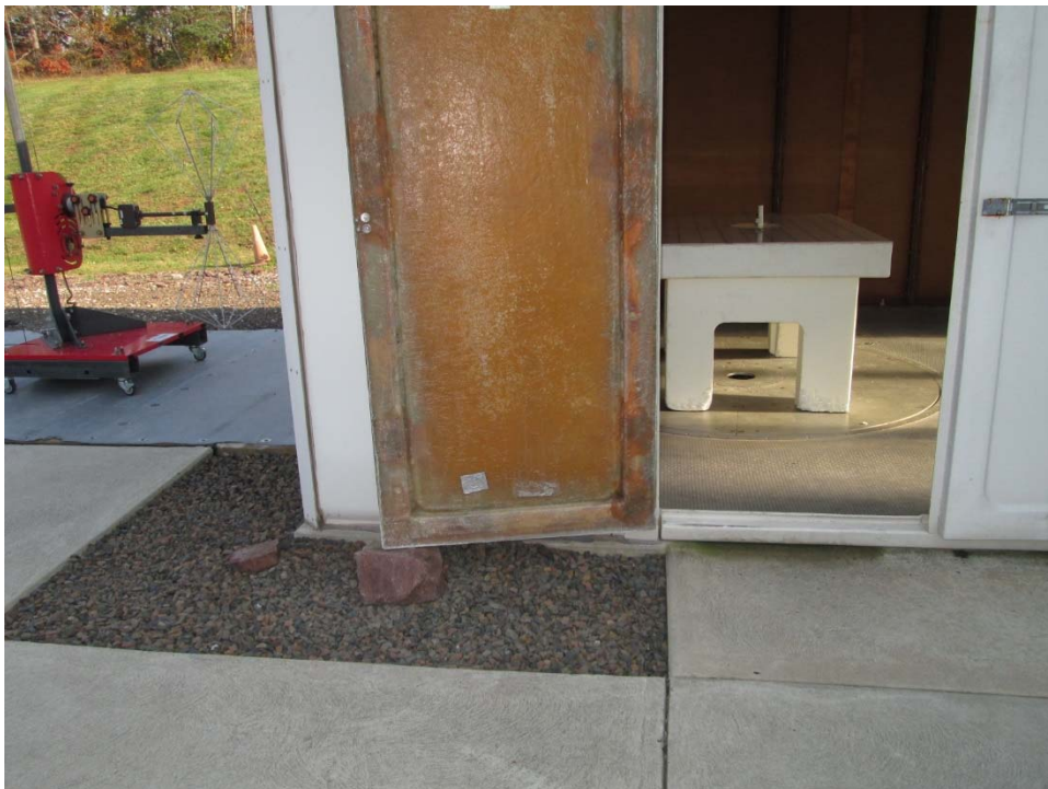
Vertical Antenna Polarization, 30 to 200 MHz