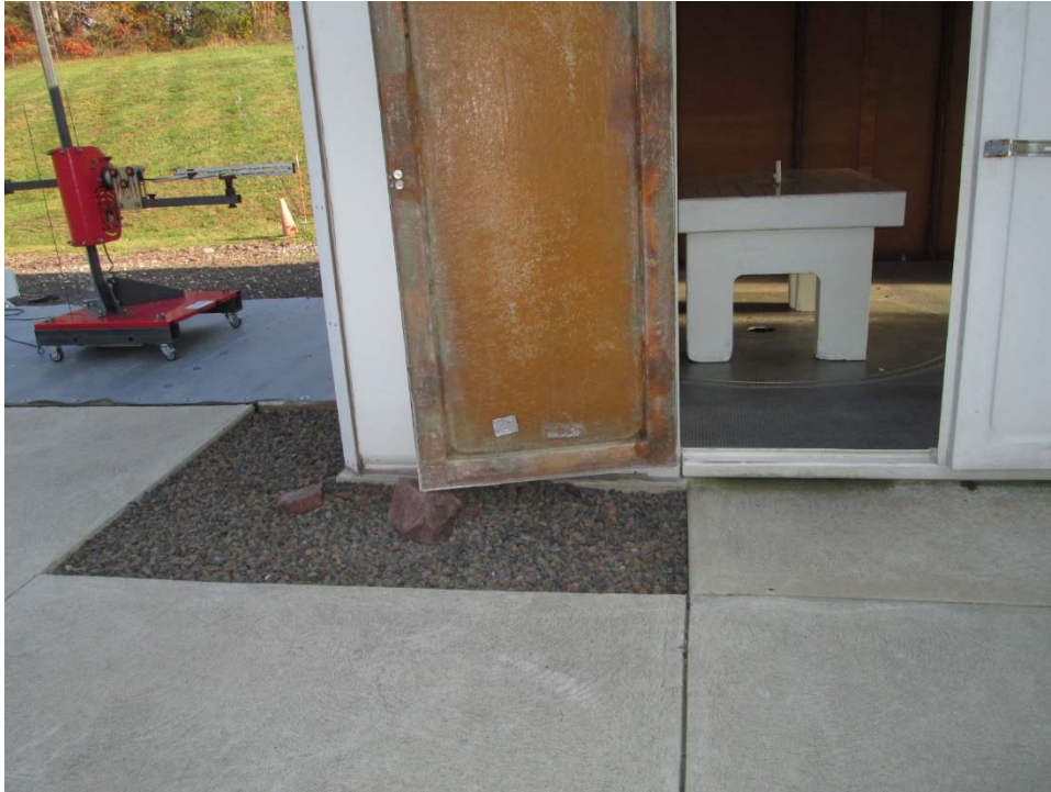
Horizontal Antenna Polarization, 200 MHz to 1 GHz