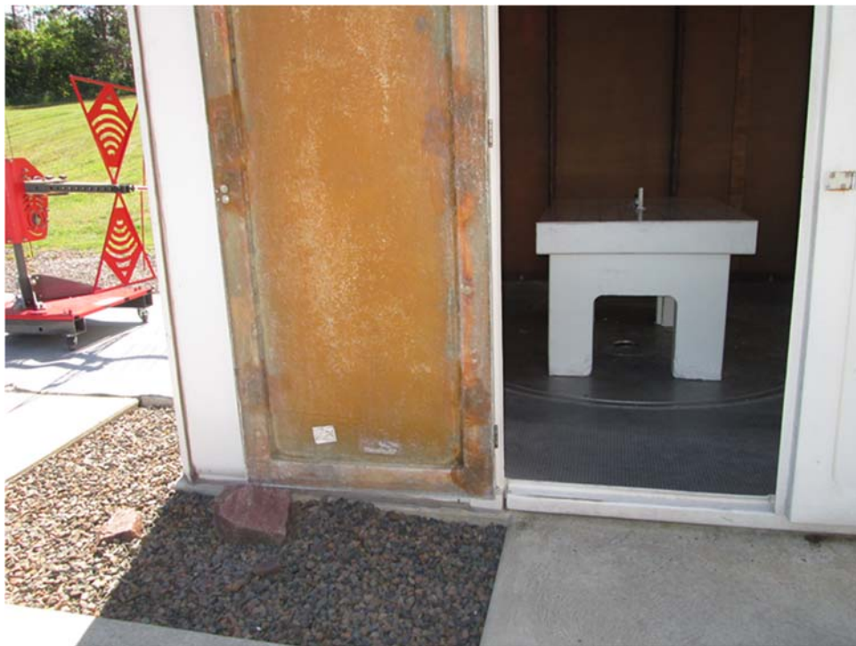
Vertical Antenna Polarization, 30 MHz to 1 GHz