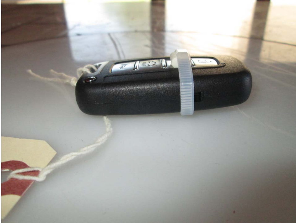
Test Setup, Z Axis