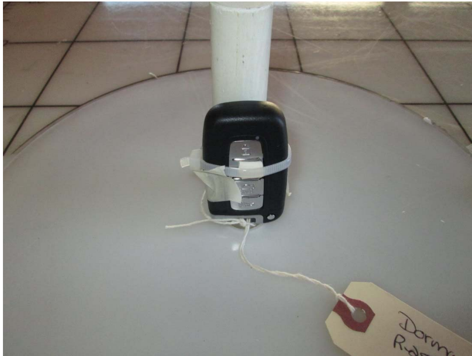
Test Setup, Z Axis