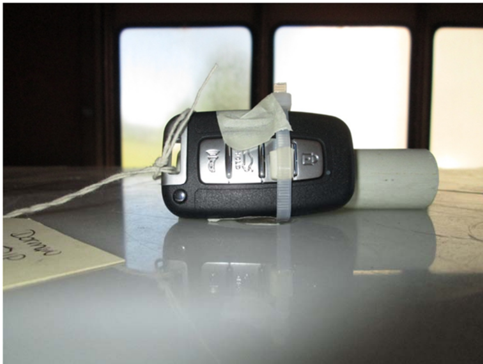
Test Setup, Y Axis