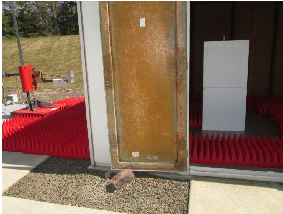
Horizontal Antenna Polarization, Above 1 GHz