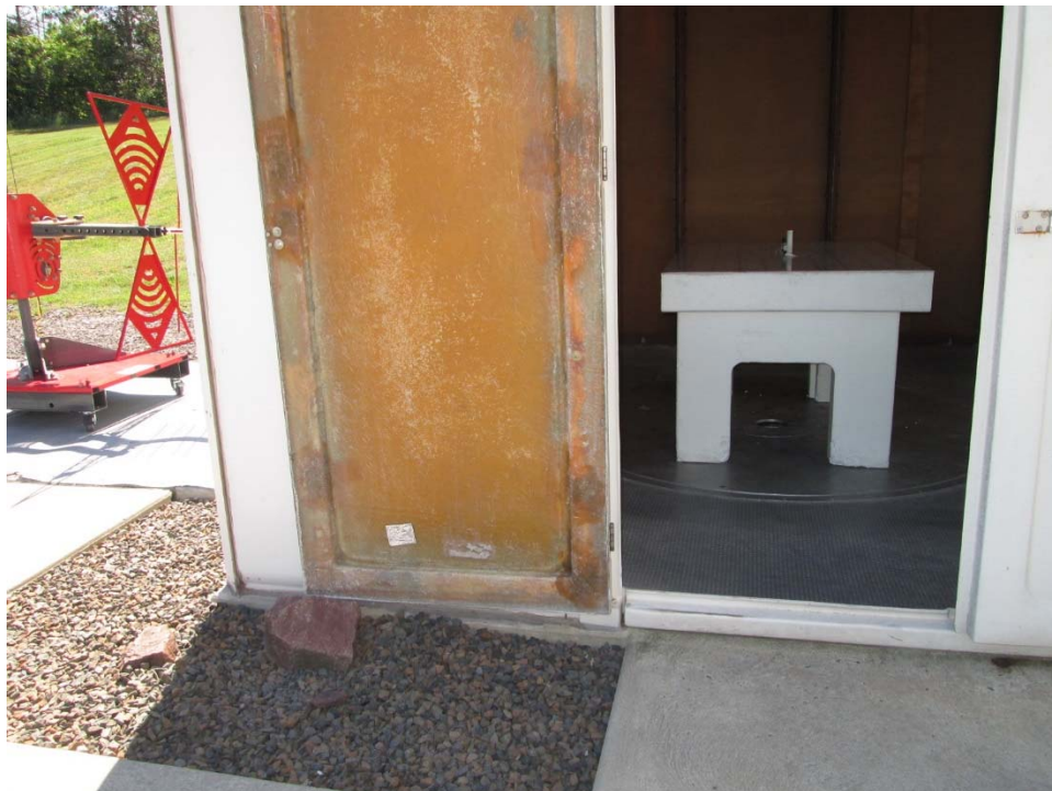
Vertical Antenna Polarization, Below 1 GHz