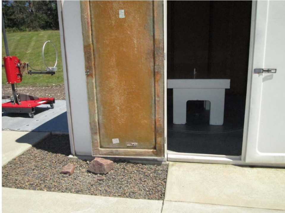
Parallel Antenna Polarization, 9 kHz to 30 MHz