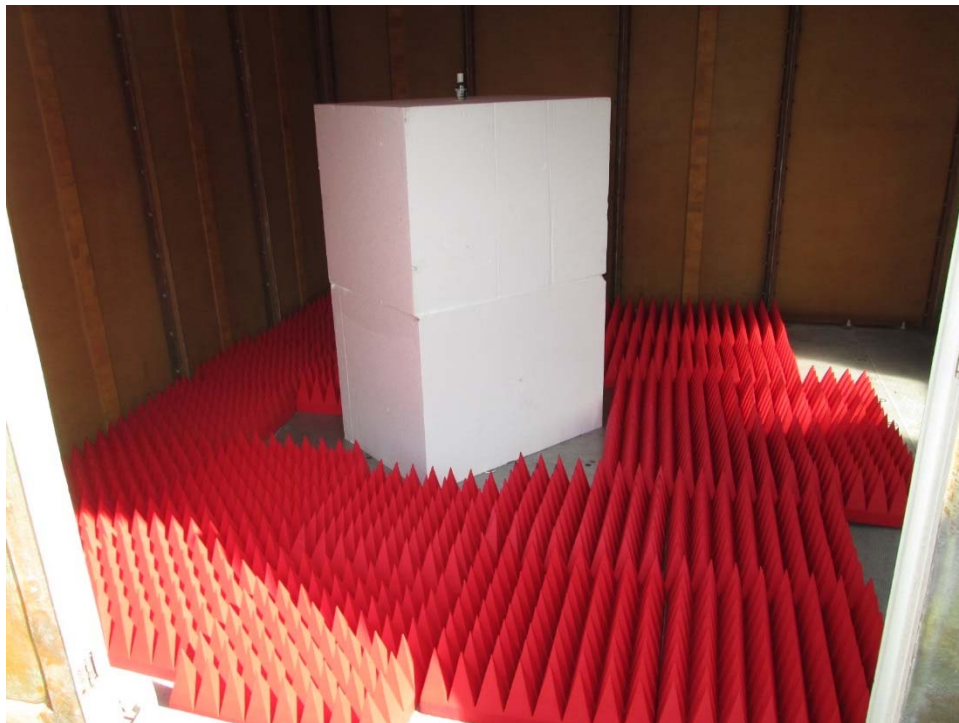
EUT Configuration above 1 GHz