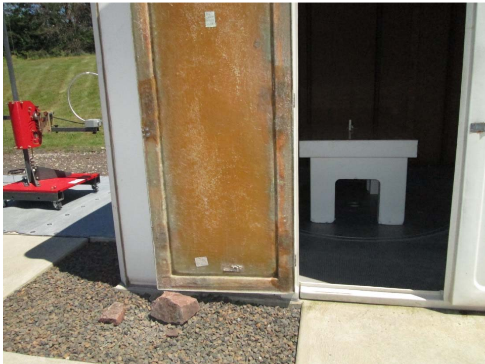
Perpendicular Antenna Polarization, 9 kHz to 30 MHz