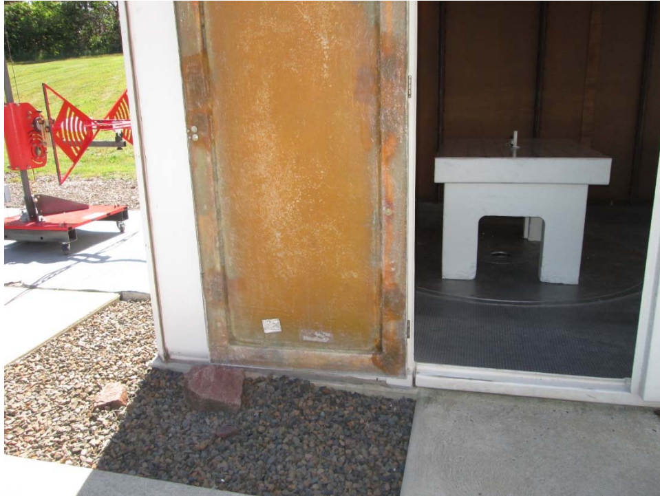
Horizontal Antenna Polarization, Below 1 GHz