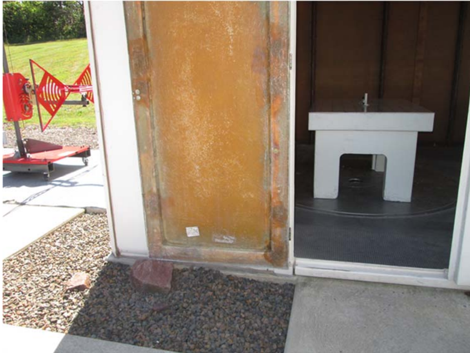
Horizontal Antenna Polarization, 30 MHz to 1 GHz