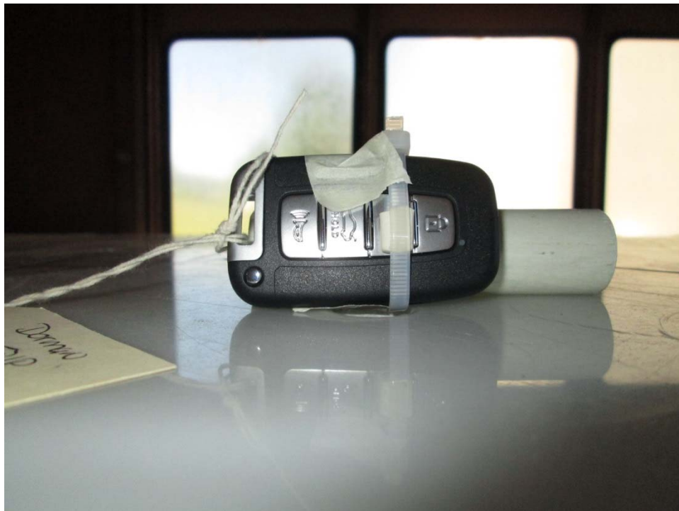
Test Setup, Y Axis