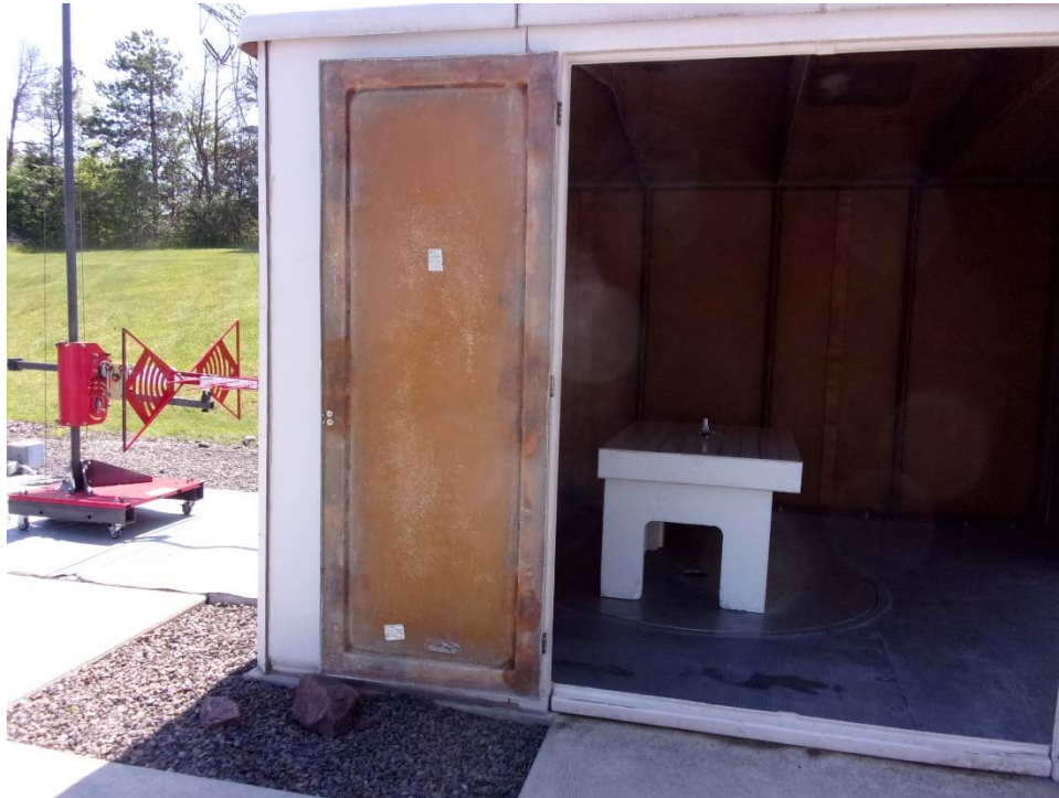
Horizontal Antenna Polarization, Below 1 GHz