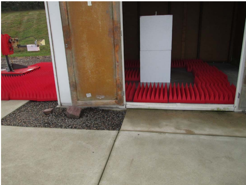
Vertical Antenna Polarization, Above 1 GHz