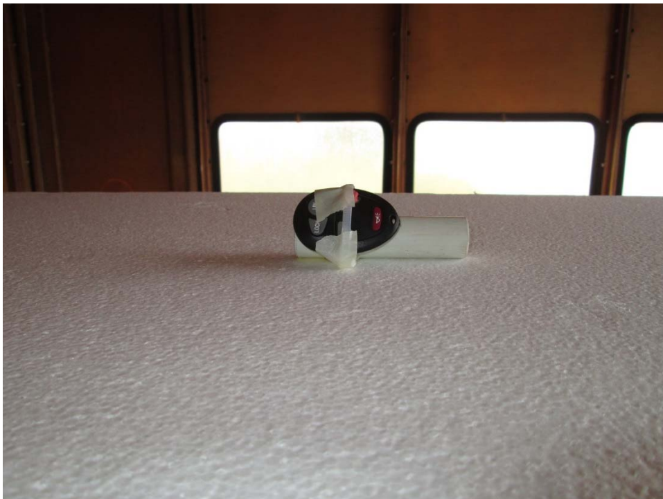
Test Setup, Y Axis, Above 1 GHz