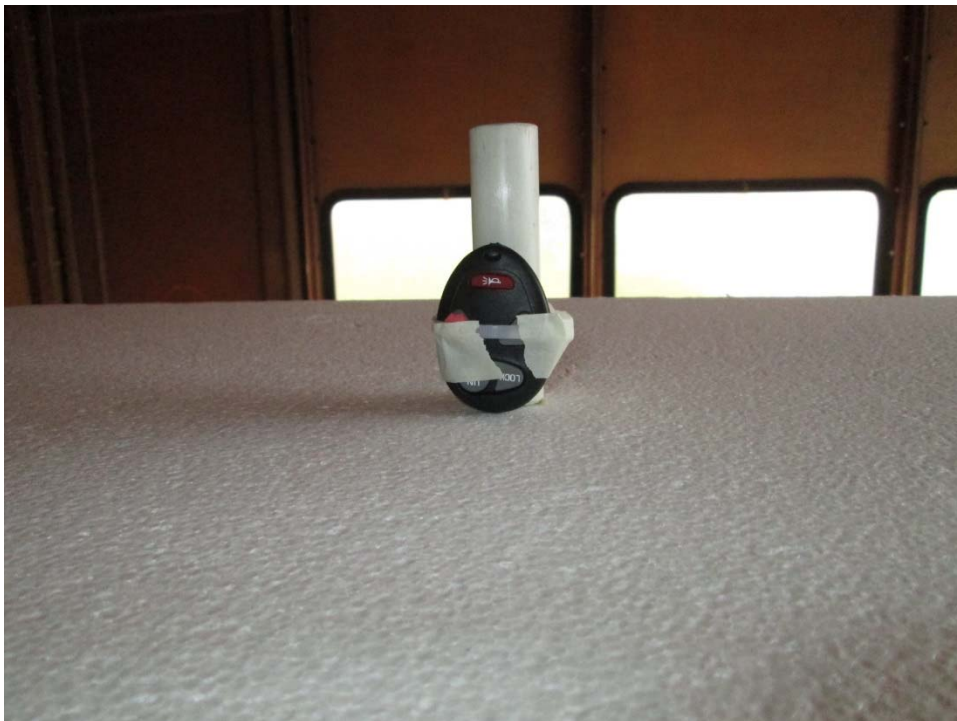
Test Setup, X Axis, Above 1 GHz