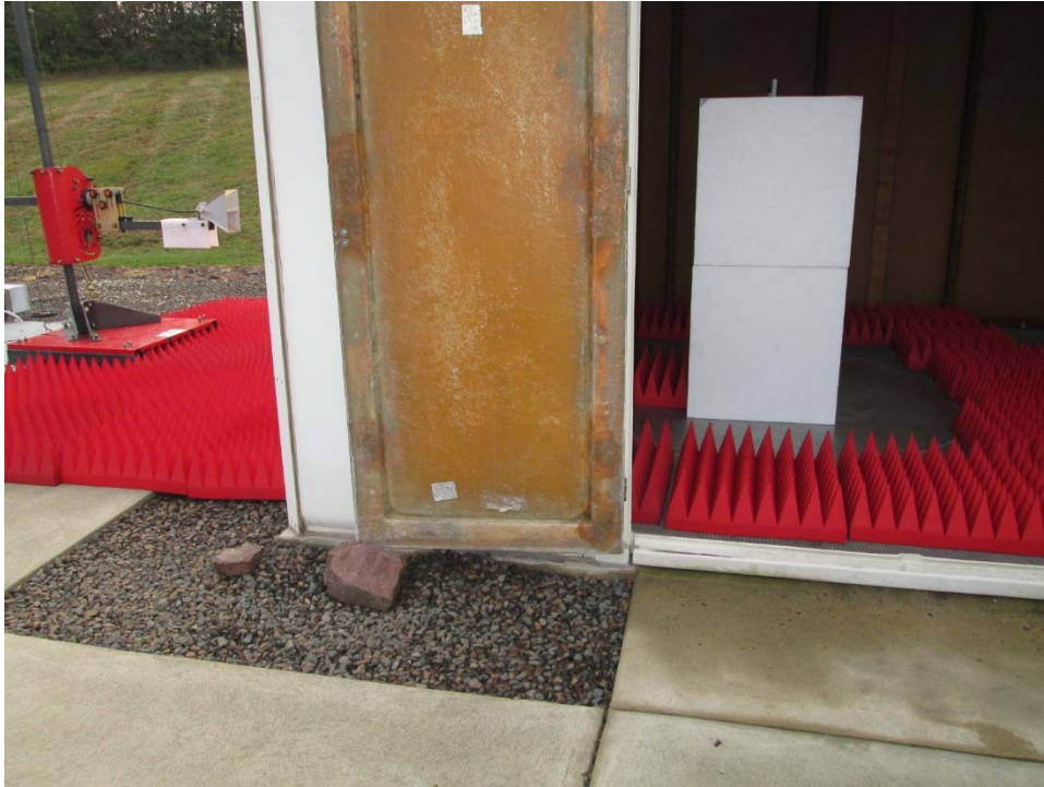
Horizontal Antenna Polarization, Above 1 GHz