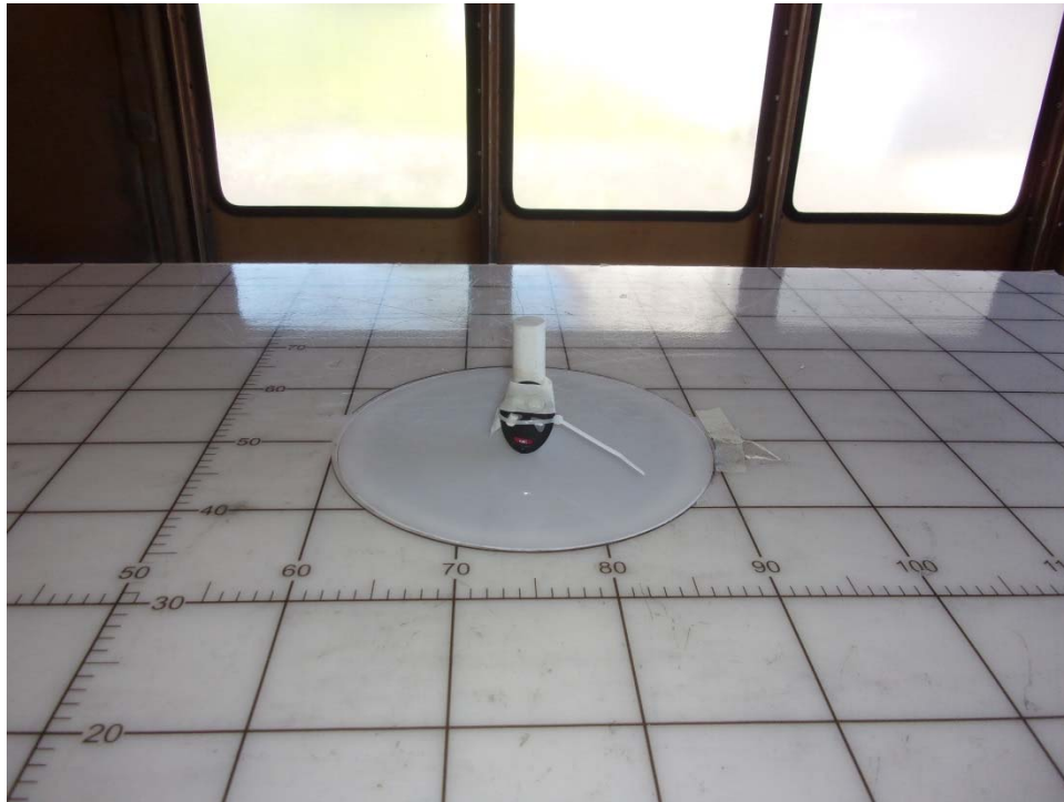
Test Setup, X Axis