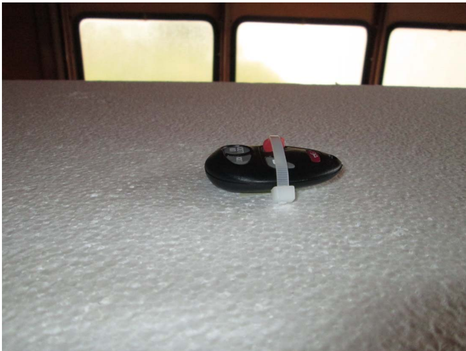
Test Setup, Z Axis, Above 1 GHz