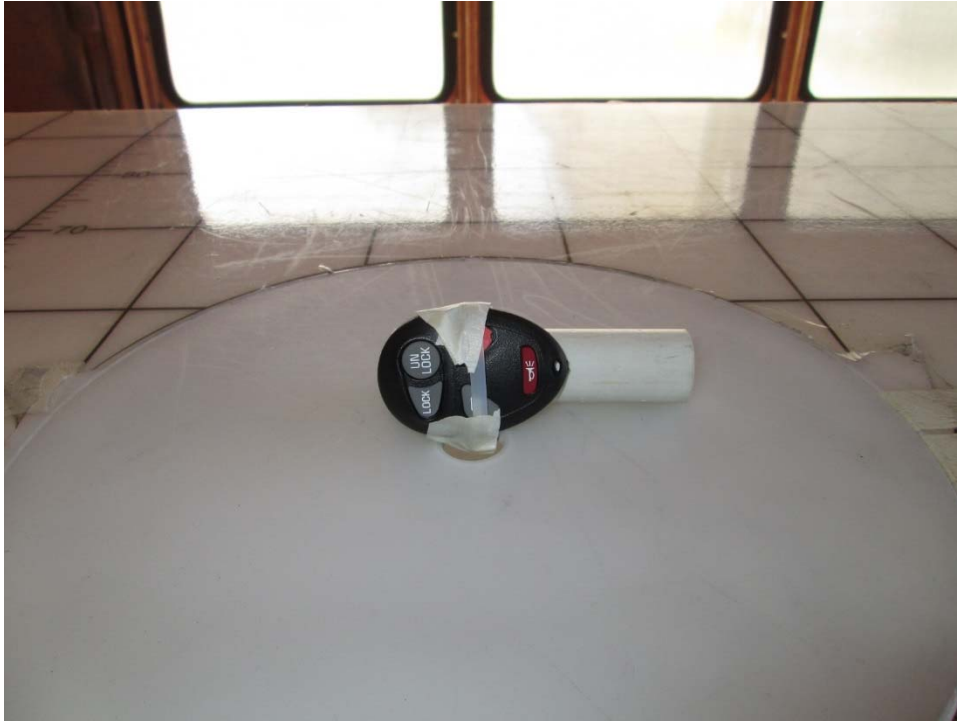
Test Setup, Y Axis, Below 1 GHz