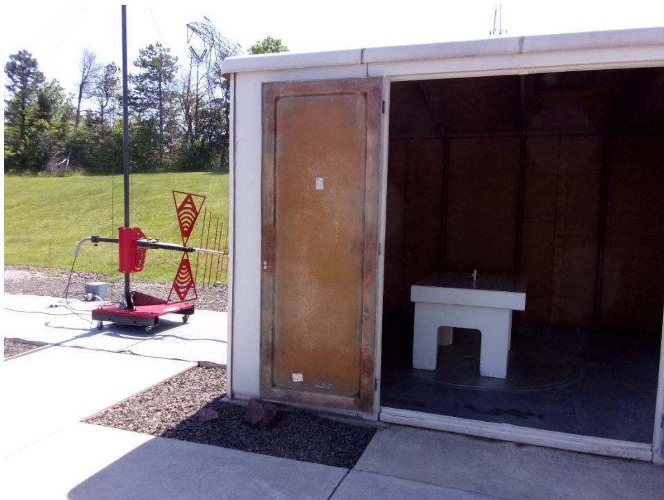
Vertical Antenna Polarization, Below 1 GHz