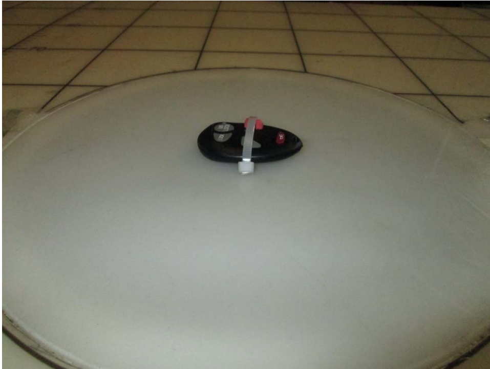
Test Setup, Z Axis, Below 1 GHz