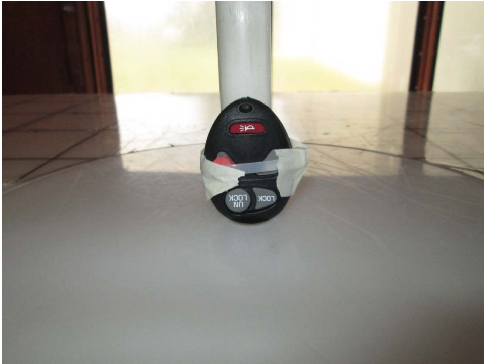
Test Setup, X Axis, Below 1 GHz