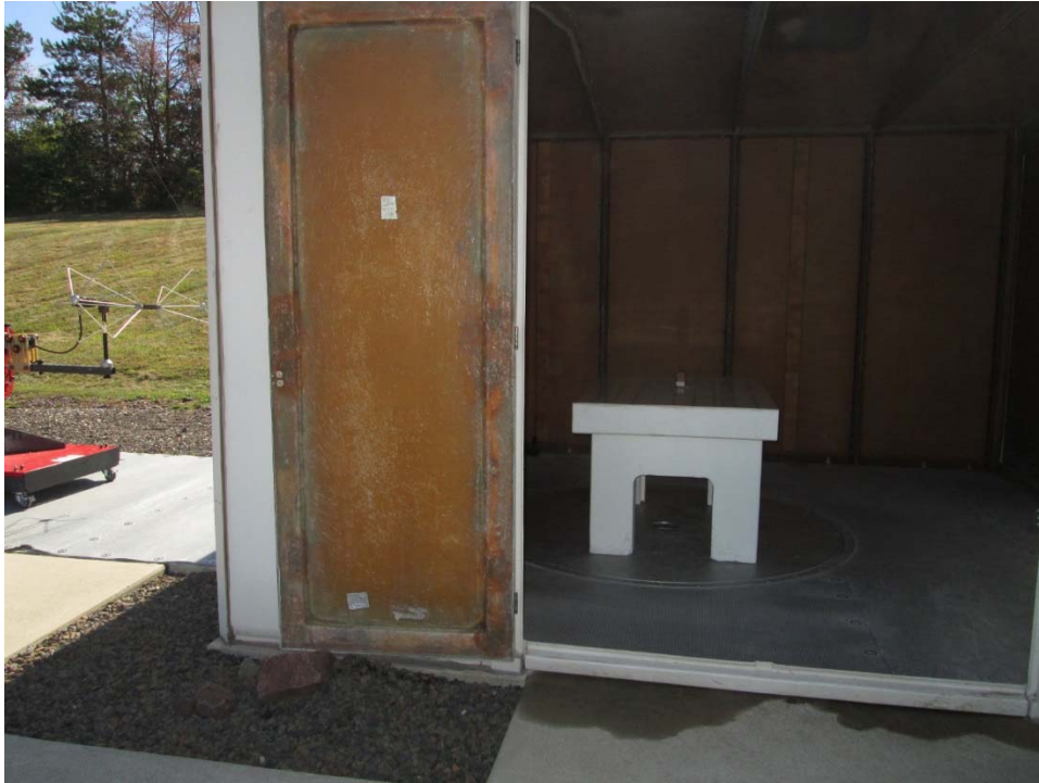
Horizontal Antenna Polarization, 30 to 200 MHz