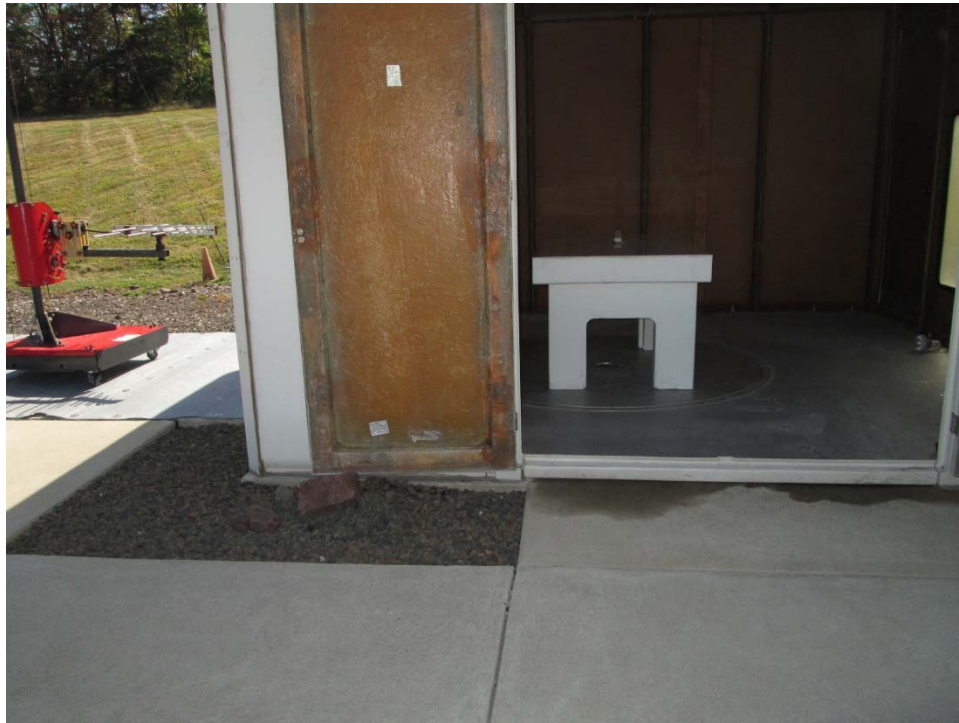
Horizontal Antenna Polarization, 200 to 1000 MHz