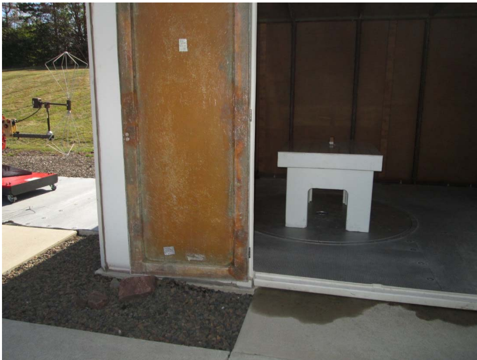
Vertical Antenna Polarization, 30 to 200 MHz