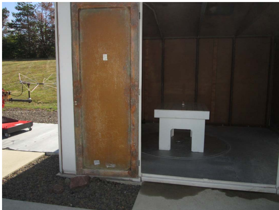
Horizontal Antenna Polarization, 30 to 200 MHz