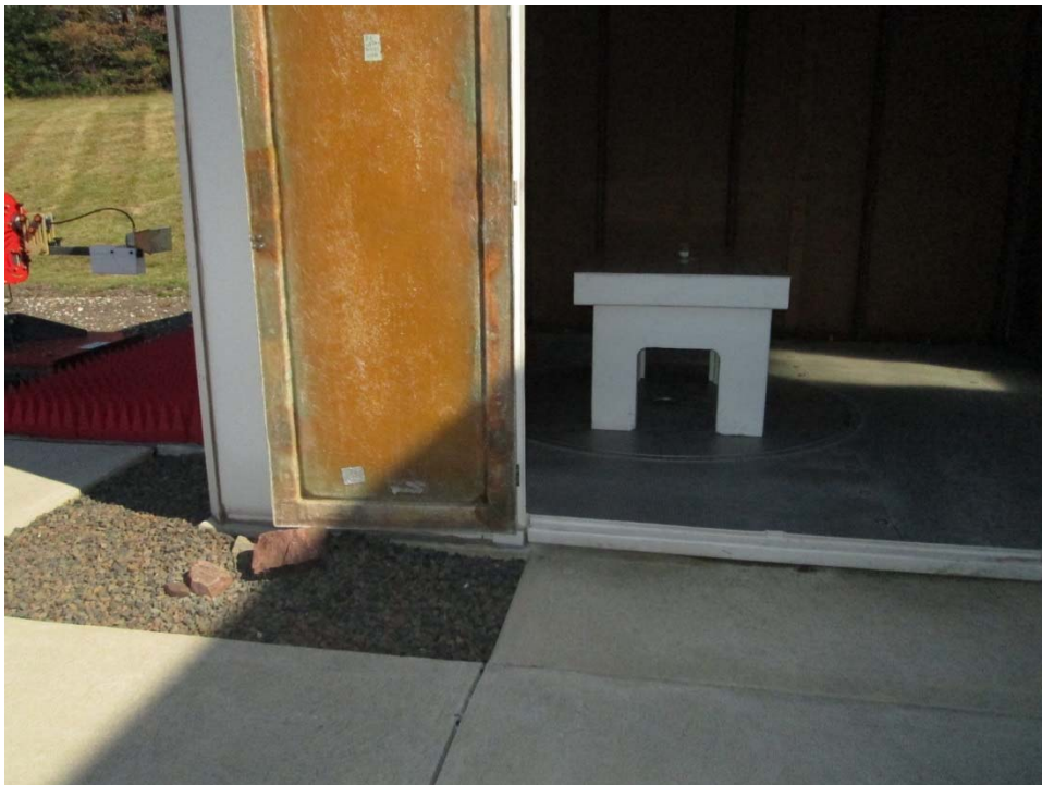
Vertical Antenna Polarization, Above 1 GHz