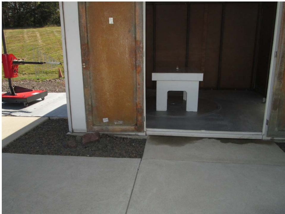
Vertical Antenna Polarization, 200 to 1000 MHz