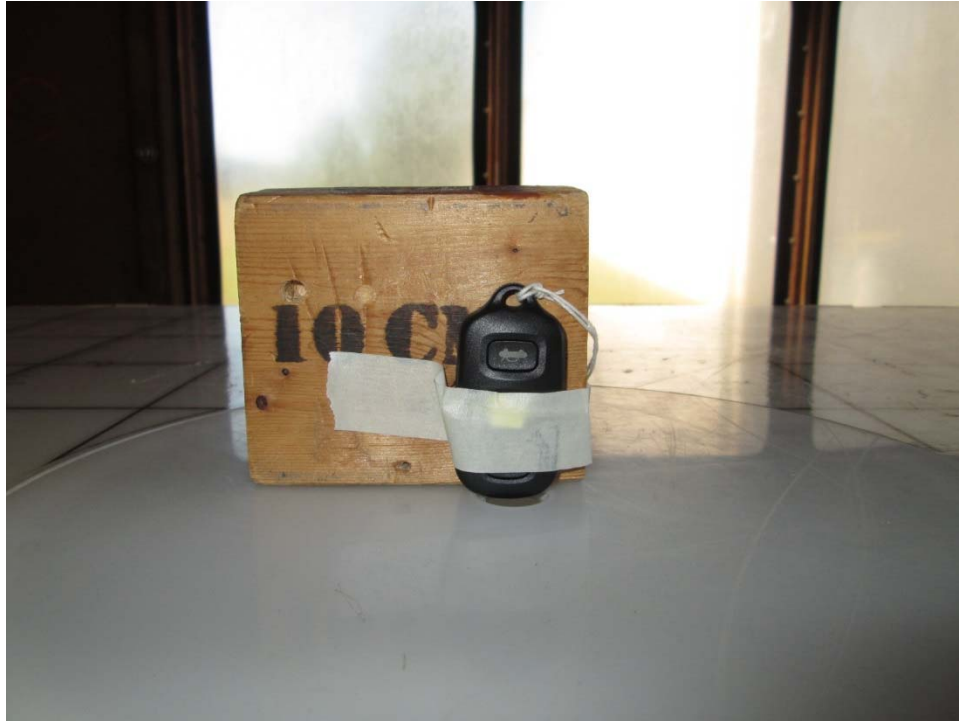
Test Setup, X Axis