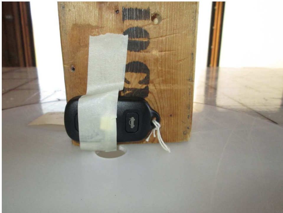
Test Setup, Y Axis