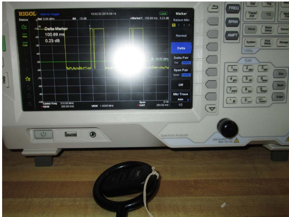
Test Setup, Spectrum Analyzer