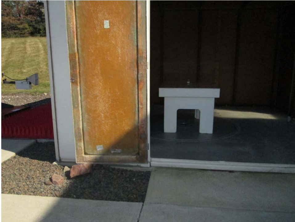
Horizontal Antenna Polarization, Above 1 GHz