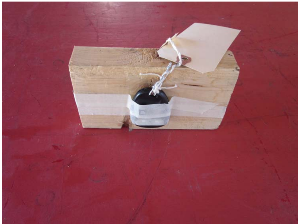
Test Setup, Y Axis