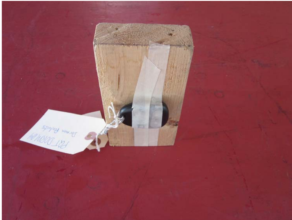
Test Setup, X Axis