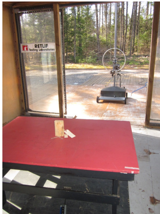
Horizontal Antenna Polarization, 9 kHz to 30 MHz