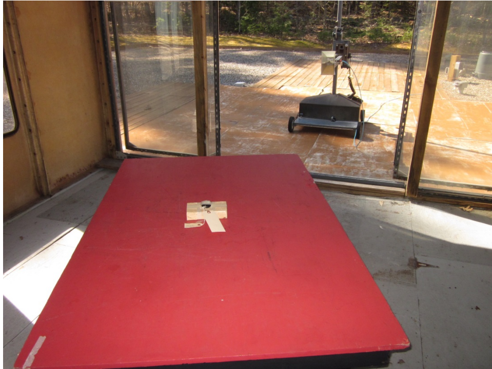
Horizontal Antenna Polarization, 1 to 3.2 GHz