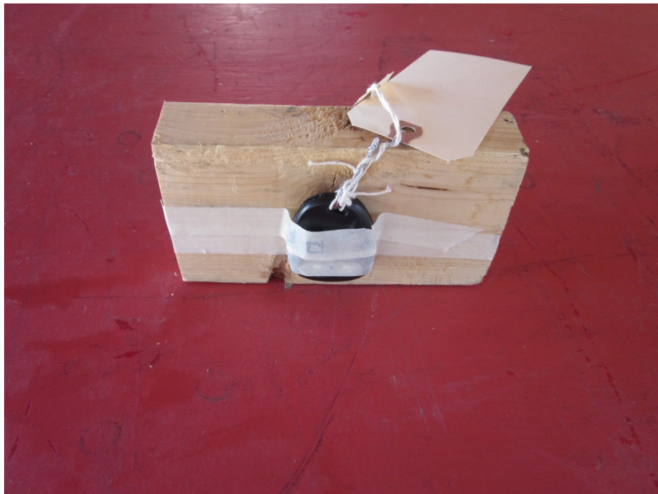
Test Setup, Y Axis