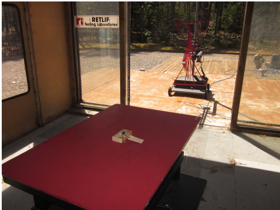
Vertical Antenna Polarization, 30 MHz to 1 GHz