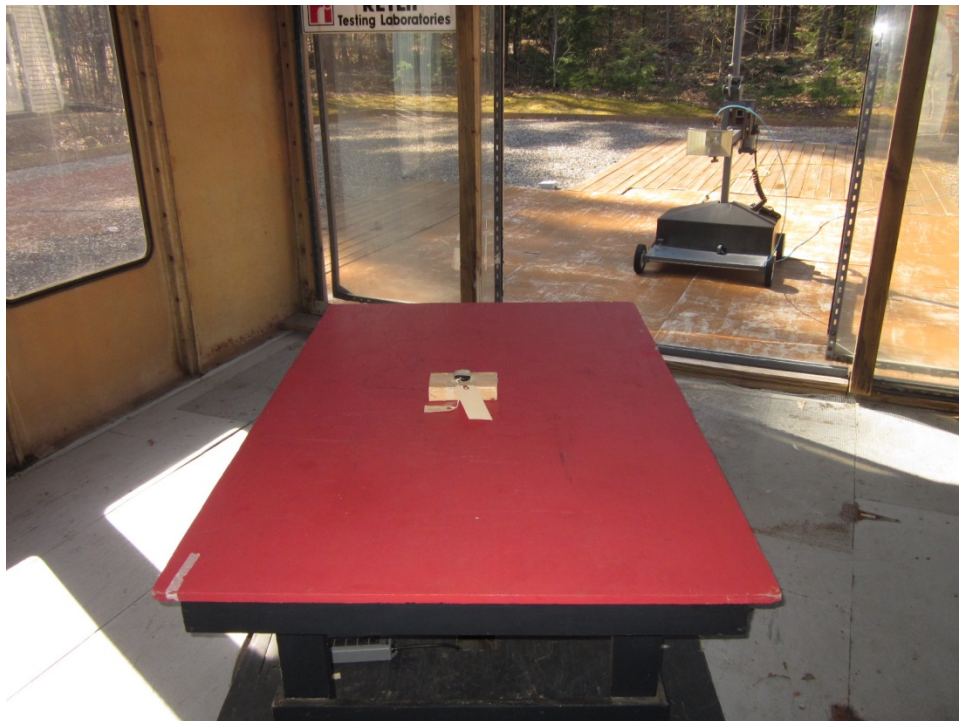
Vertical Antenna Polarization, 1 to 3.2 GHz