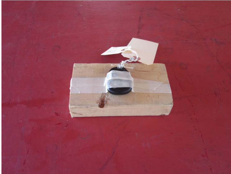
Test Setup, Z Axis