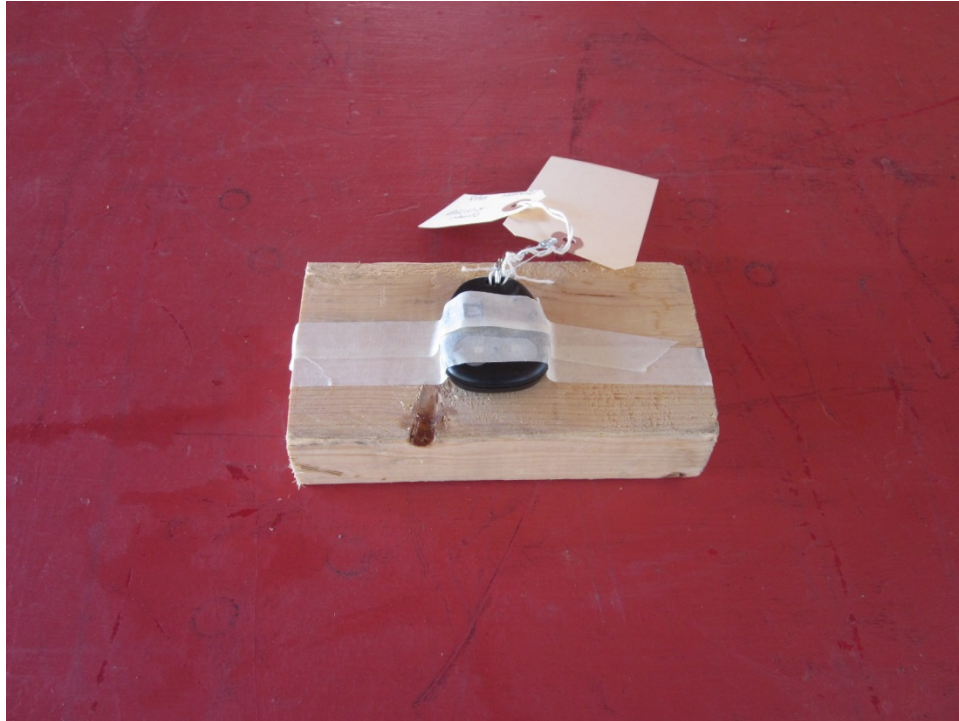
Test Setup, Z Axis