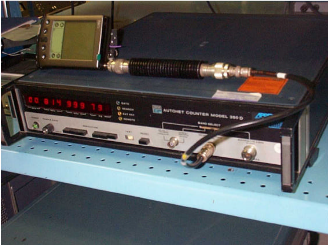
Palm and Wavenet DUALWAVE M Wireless Modem tested for Frequency Stability at Power Variation