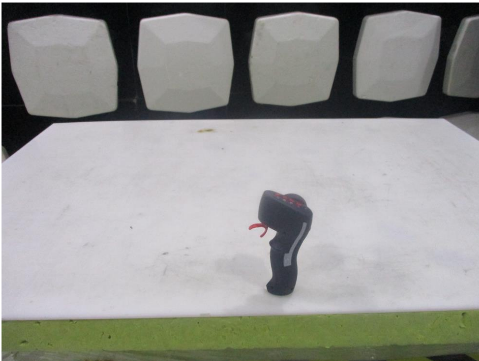
Up to 1GHz (EUT was placed in the centre of the turntable)