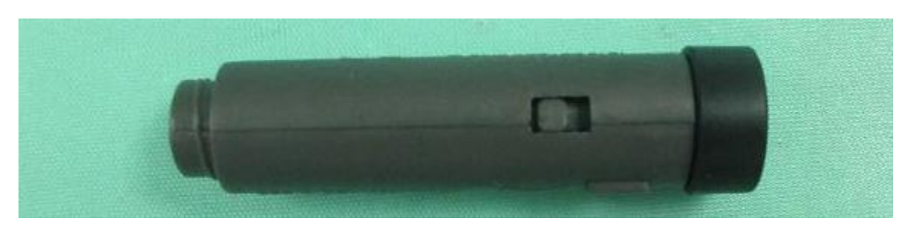
BTTOM VIEW OF THE PRODUCT