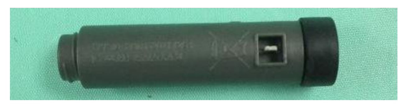
REAR VIEW OF THE PRODUCT