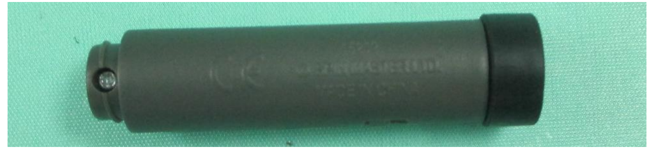
LEFT VIEW OF THE PRODUCT