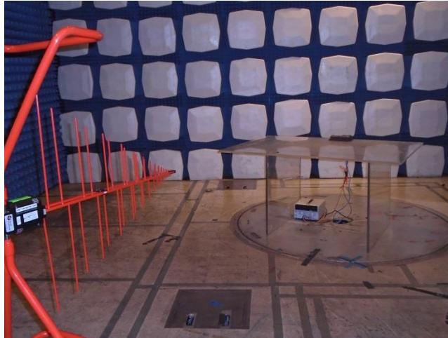
Photograph 1. Radiated Spurious Emissions, Test Setup, 30 MHz – 1 GHz