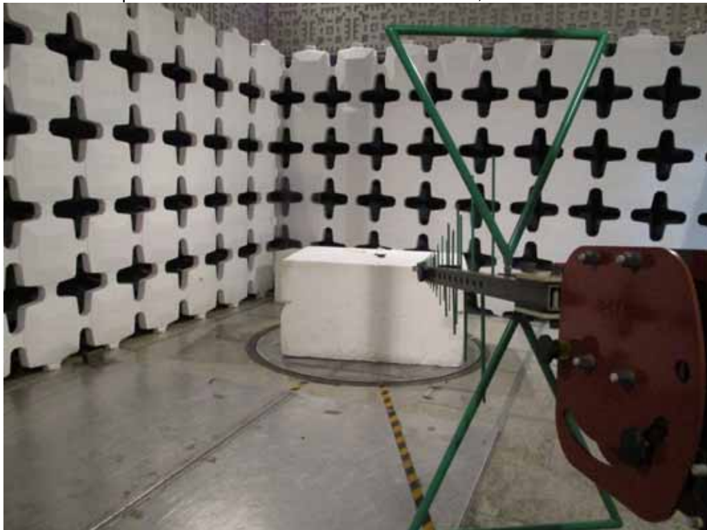
Test Setup for Radiated Emissions – 30MHz to 1GHz, Vertical Polarization