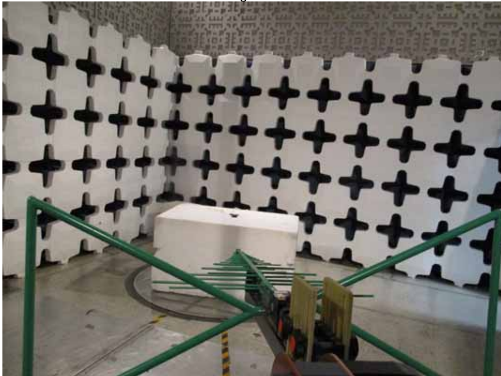
Test Setup for Radiated Emissions – 30MHz to 1GHz, Horizontal Polarization