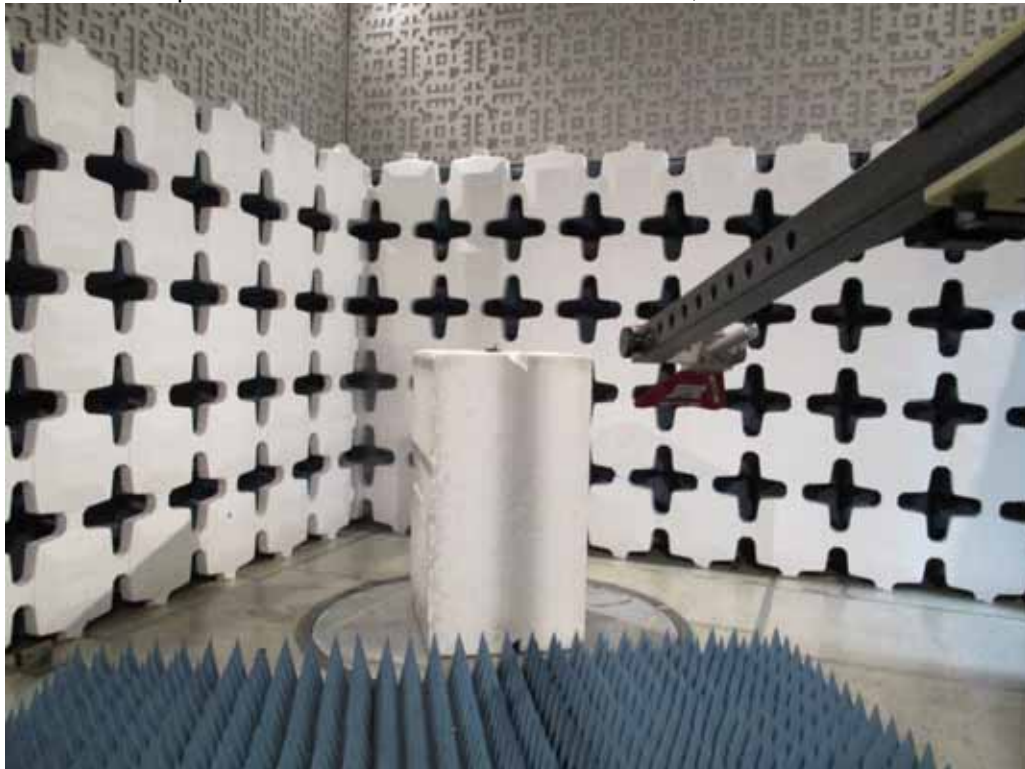
Test Setup for Radiated Emissions – 1GHz to 18GHz, Vertical Polarization