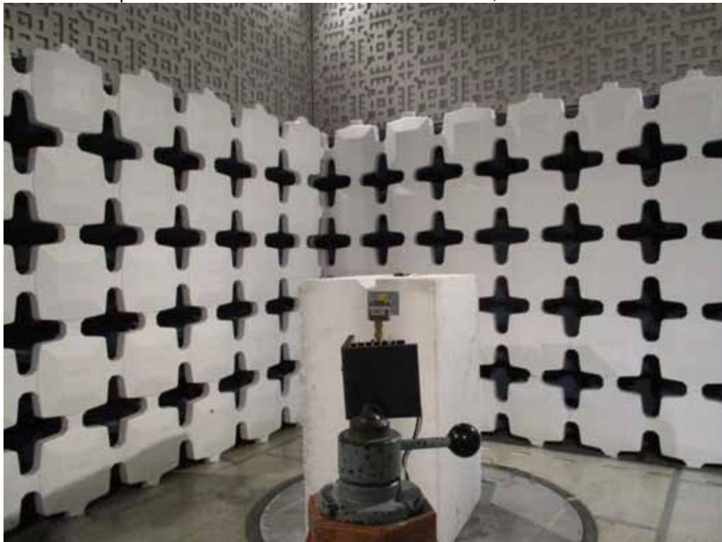
Test Setup for Radiated Emissions – 18GHz to 25GHz, Vertical Polarization