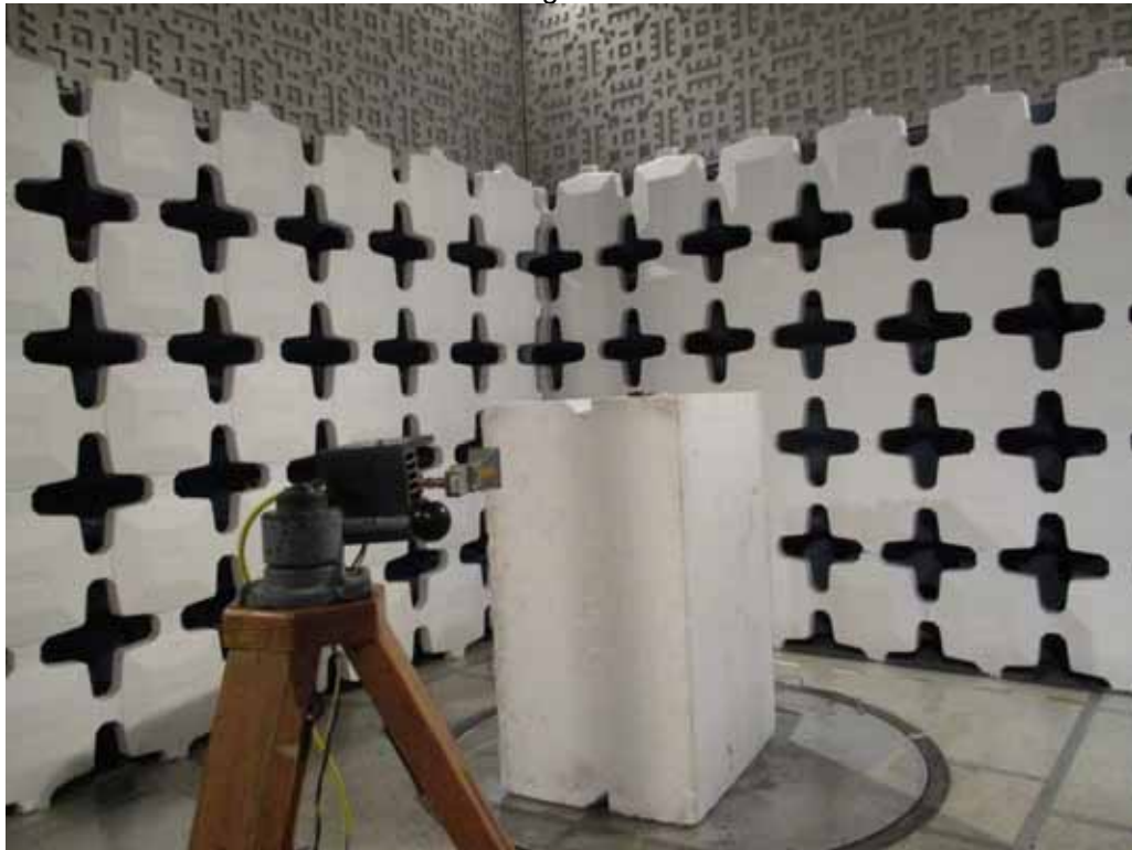
Test Setup for Radiated Emissions – 18GHz to 25GHz, Horizontal Polarization