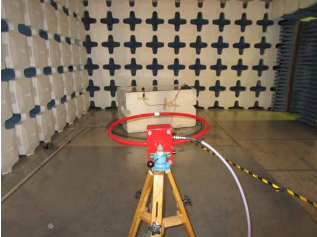
Test Setup for Radiated Emissions, 150kHz to 30MHz – Horizontal Polarization