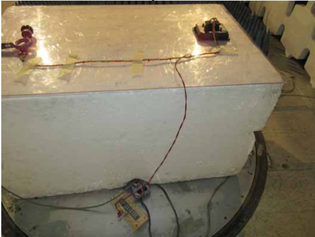
Photograph of the EUT