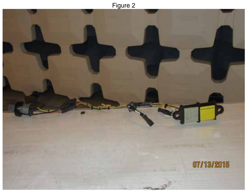
Photograph of the EUT