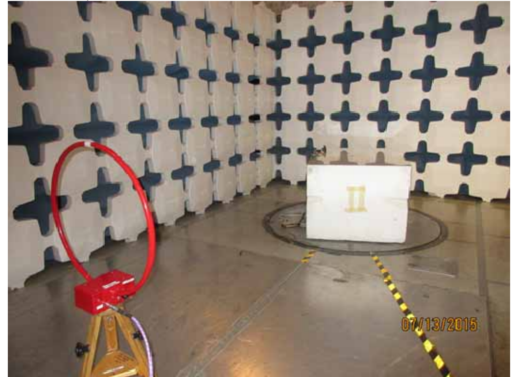
Test Setup for Radiated Emissions, 150kHz to 30MHz – Vertical Polarization

Test Setup for Radiated Emissions, 150kHz to 30MHz – Horizontal Polarization