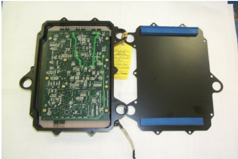
Caterpillar MSS control module (open)