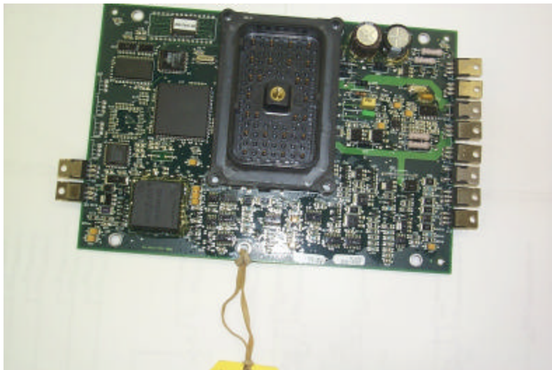
Caterpillar MSS PCB (top)