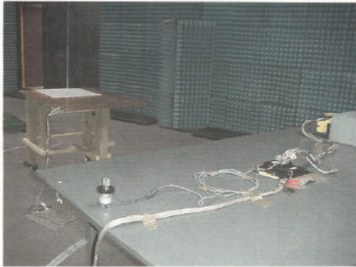
Caterpillar MSS on OATS