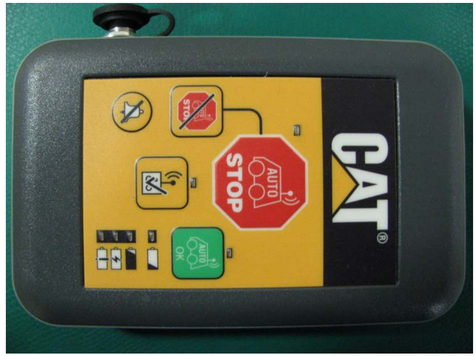
Figure 7 – Enclosure, Front side

Type: Specification Doc No: CAT0000736 Rev: A Date: Feb 28, 2012 Page: 5 of 5