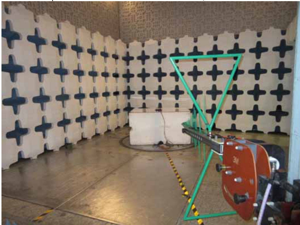
Test Setup for Radiated Emissions – 30MHz to 1GHz, Vertical Polarization