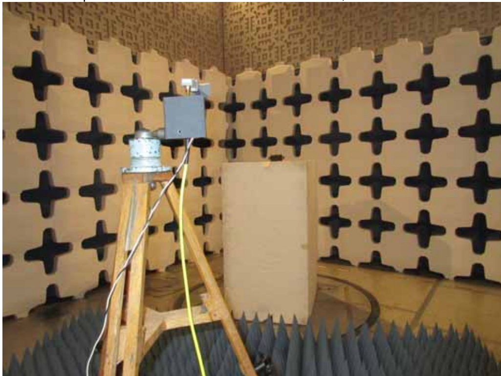
Test Setup for Radiated Emissions – 18GHz to 25GHz, Vertical Polarization