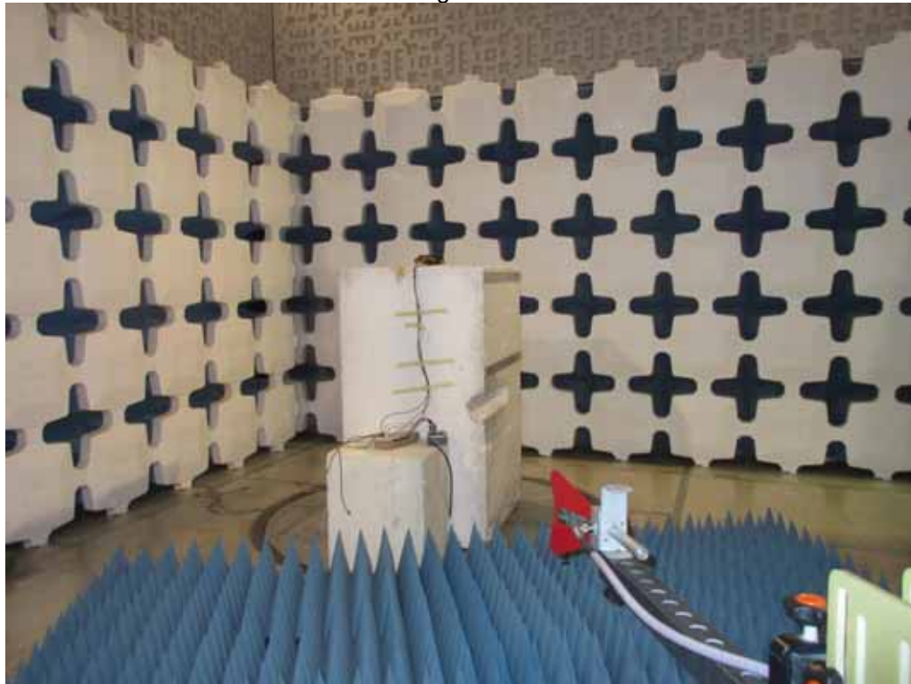
Test Setup for Radiated Emissions – 1GHz to 18GHz, Horizontal Polarization