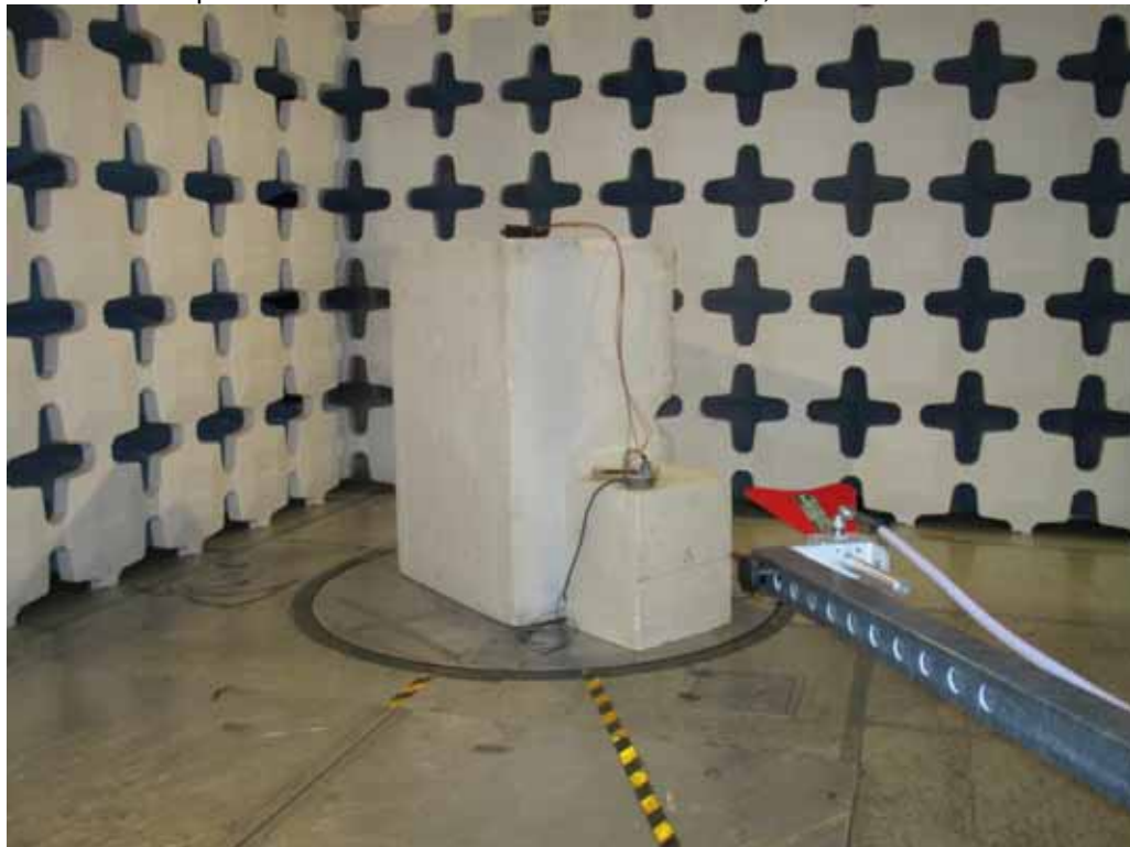
Test Setup for Radiated Emissions – 1GHz to 18GHz, Vertical Polarization