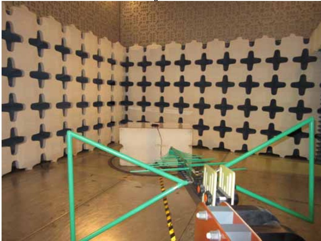
Test Setup for Radiated Emissions – 30MHz to 1GHz, Horizontal Polarization