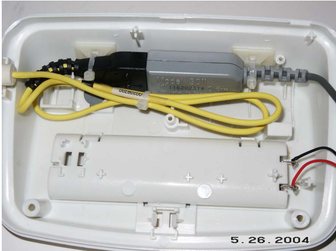
Inside of housing with PCB removed showing the SPO2 measurement device and battery connections.