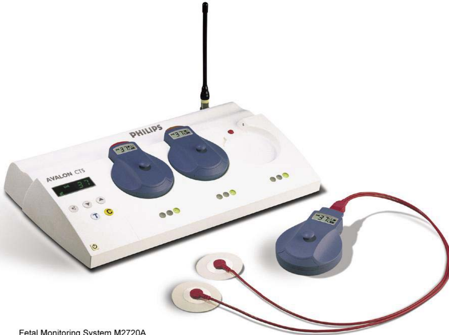
Fetal Monitoring System M2720A Avalon CTS