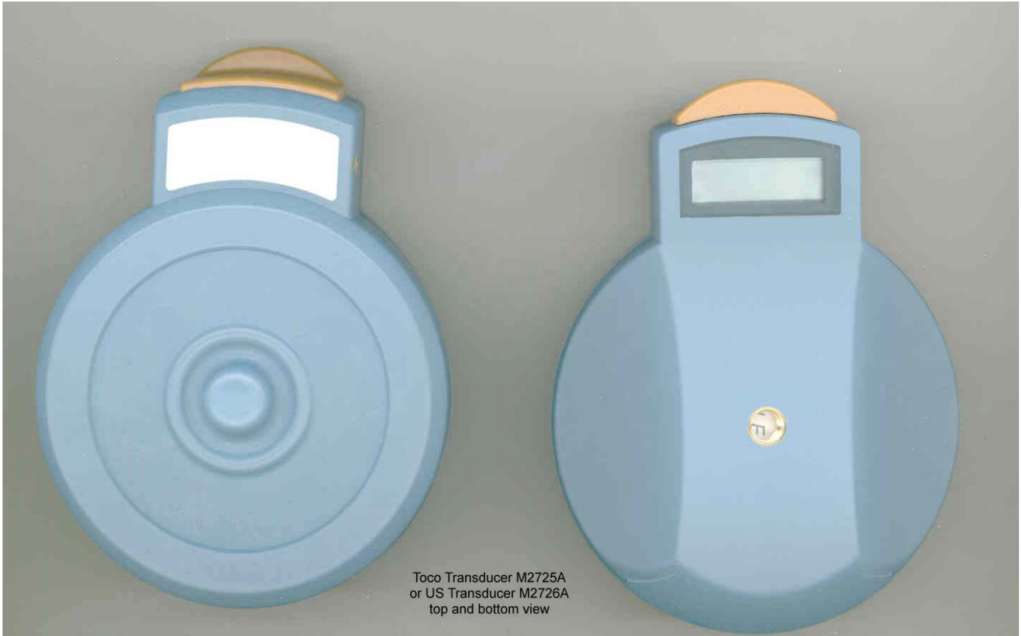
Toco Transducer M2725A or US Transducer M2726A top and bottom view