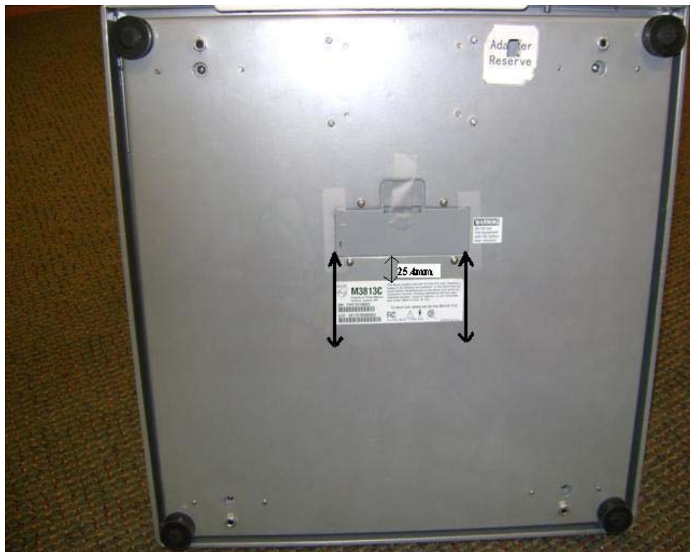
Figure 8: Label at the bottom of the scale