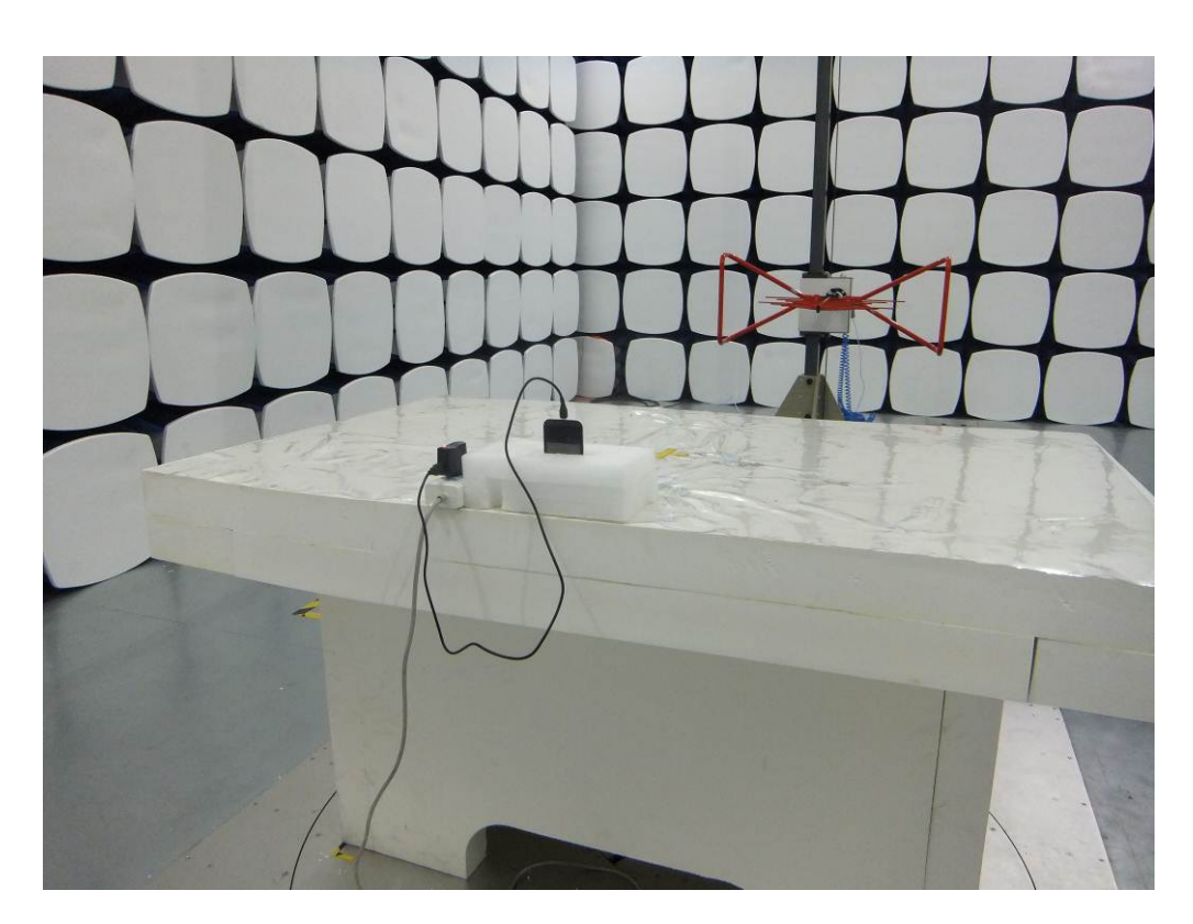
Radiated Spurious Emissions Test Setup Below 1GHz - Front View

14070433-FCC-R4 September 04, 2014 43 of 49