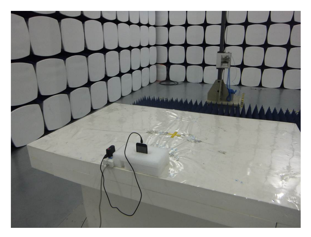
Radiated Spurious Emissions Test Setup Above 1GHz -Front View