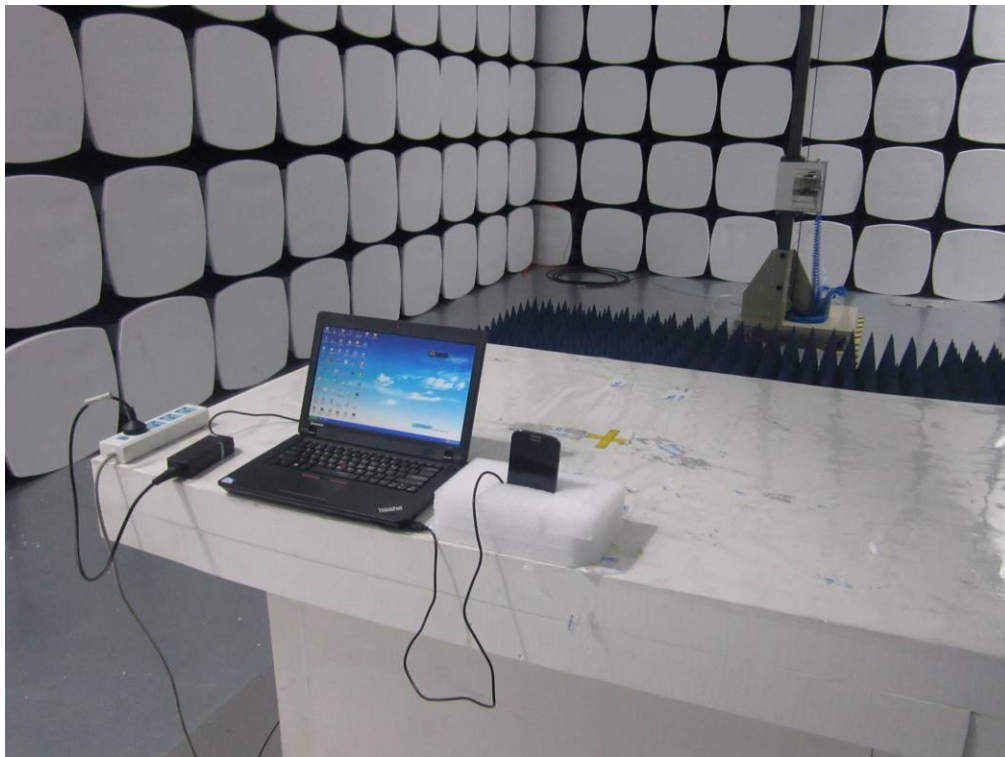
Radiated Spurious Emissions Test Setup Above 1GHz –Front View