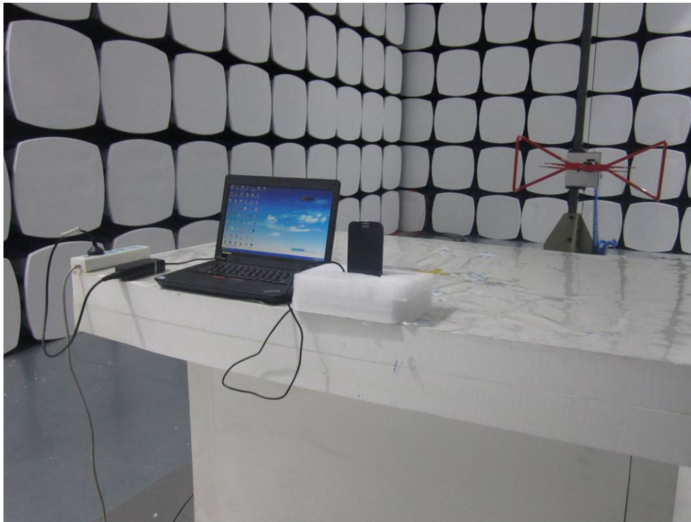
Radiated Spurious Emissions Test Setup Below 1GHz - Front View

Report No.: 14070280-FCC-E1 Issue Date: June 23, 2014 Page: 31 of 37 www.siemic.com www.siemic.com.cn