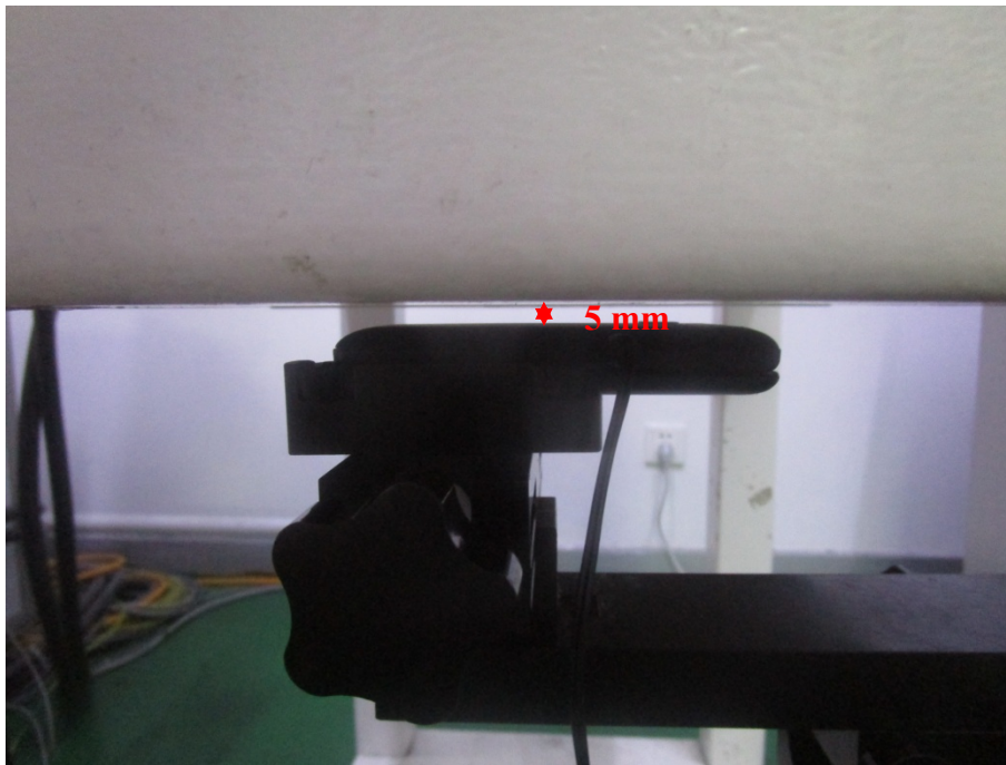
Body Back Setup Photo (5mm)