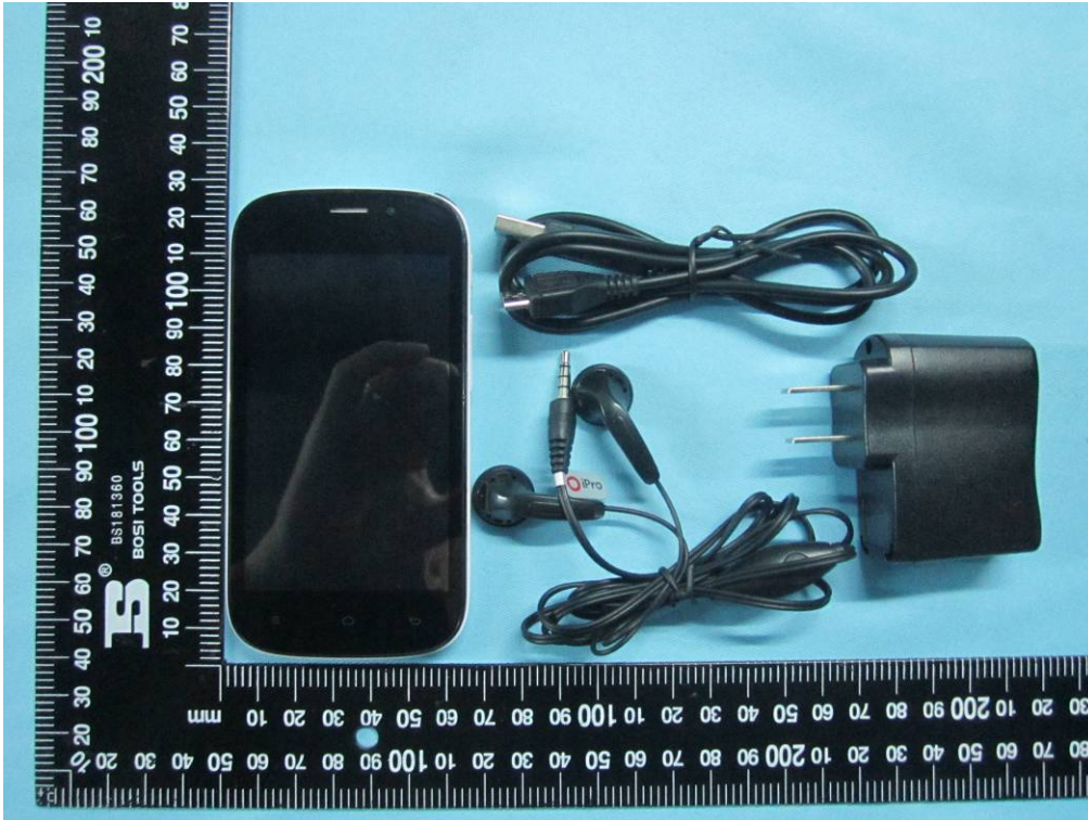
Whole Package - Top View