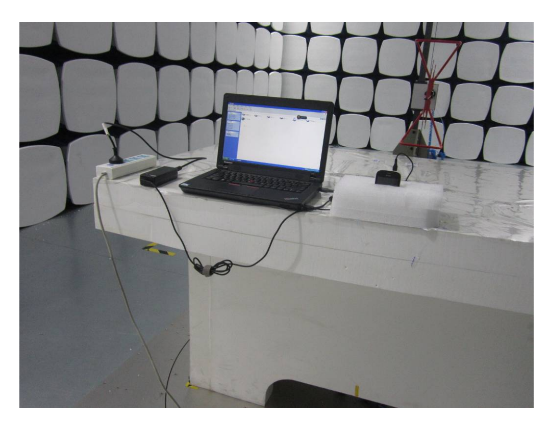
Radiated Spurious Emissions Test Setup Below 1GHz - Front View

Report No.: 14070231-FCC-E1 Issue Date: May 24, 2014 Page: 30 of 36 www.siemic.com