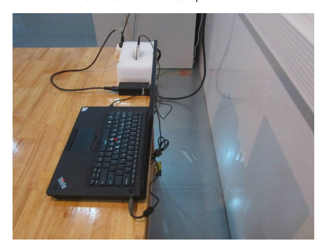
Conducted Emissions Test Setup Side View