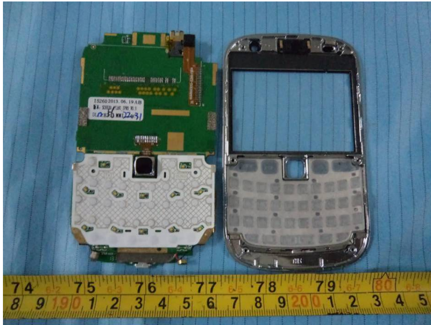
EUT – Main Board Top with Keypad View