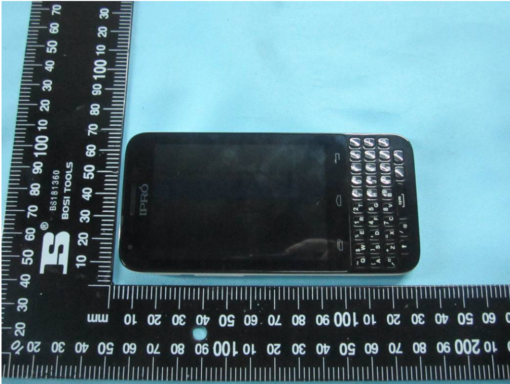
EUT - Front View