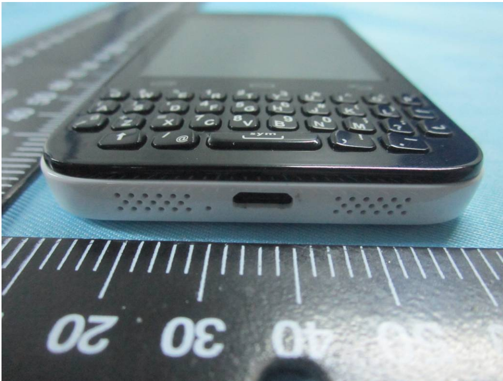
EUT - Bottom View