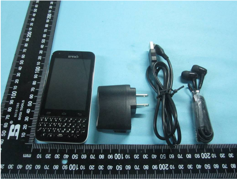
Whole Package - Top View