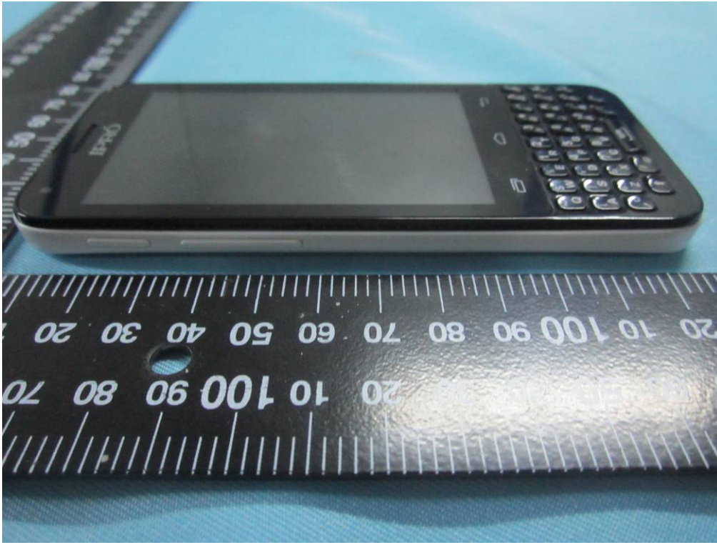
EUT - Left View

Report No.: 14070190-FCC-E1 Issue Date: May 07, 2014 Page: 22 of 34 www.siemic.com www.siemic.com.cn