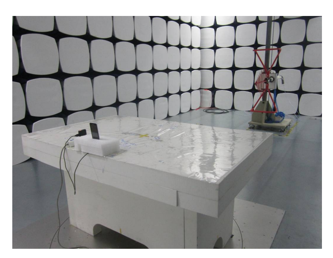
Radiated Spurious Emissions Test Setup Below 1GHz - Front View

Report No: 14070190-FCC-R2 Issue Date: May 07, 2014 Page: 74 of 80 www.siemic.com www.siemic.com.cn